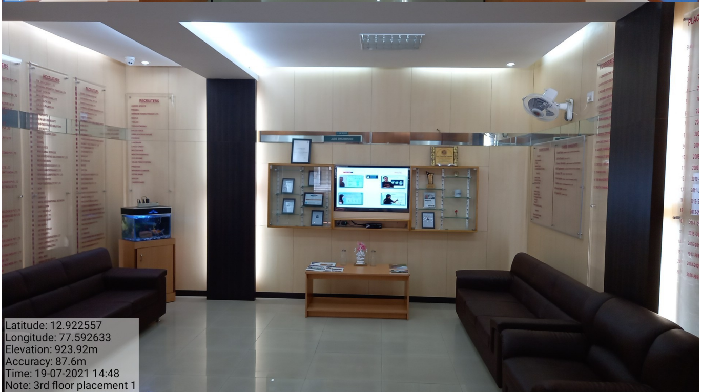
Latitude: 12.922557 Longitude: 77.592633 Elevation: 923.92m Accuracy: 87.6m Time: 19-07-2021 14:48 Note: 3rd floor placement 1