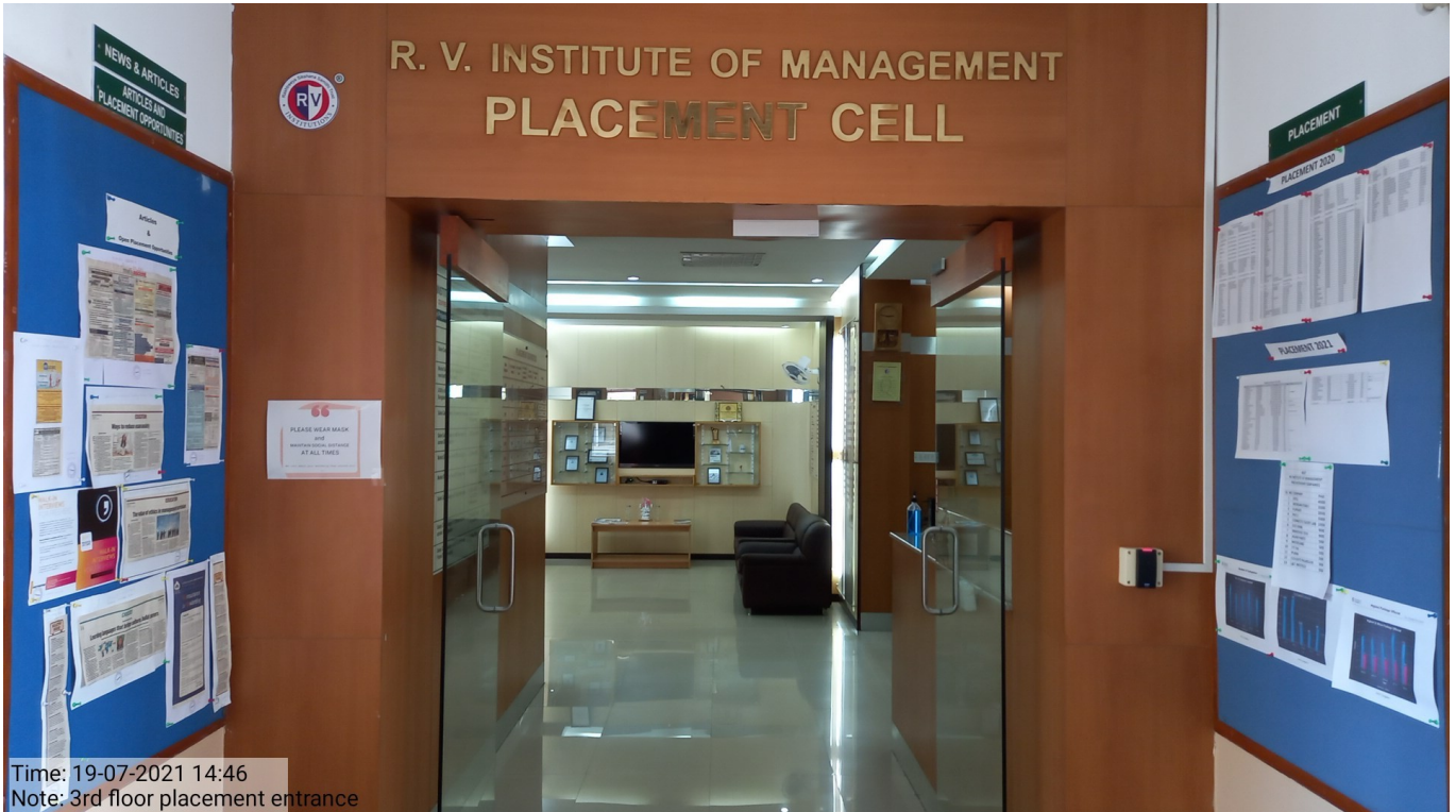
Time: 19-07-2021 14:46 Note: 3rd floor placement entrance