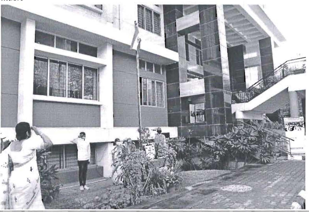
Page 1 of 4