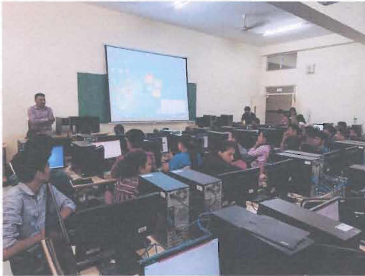
Photo showing the student's in the Lab Session.