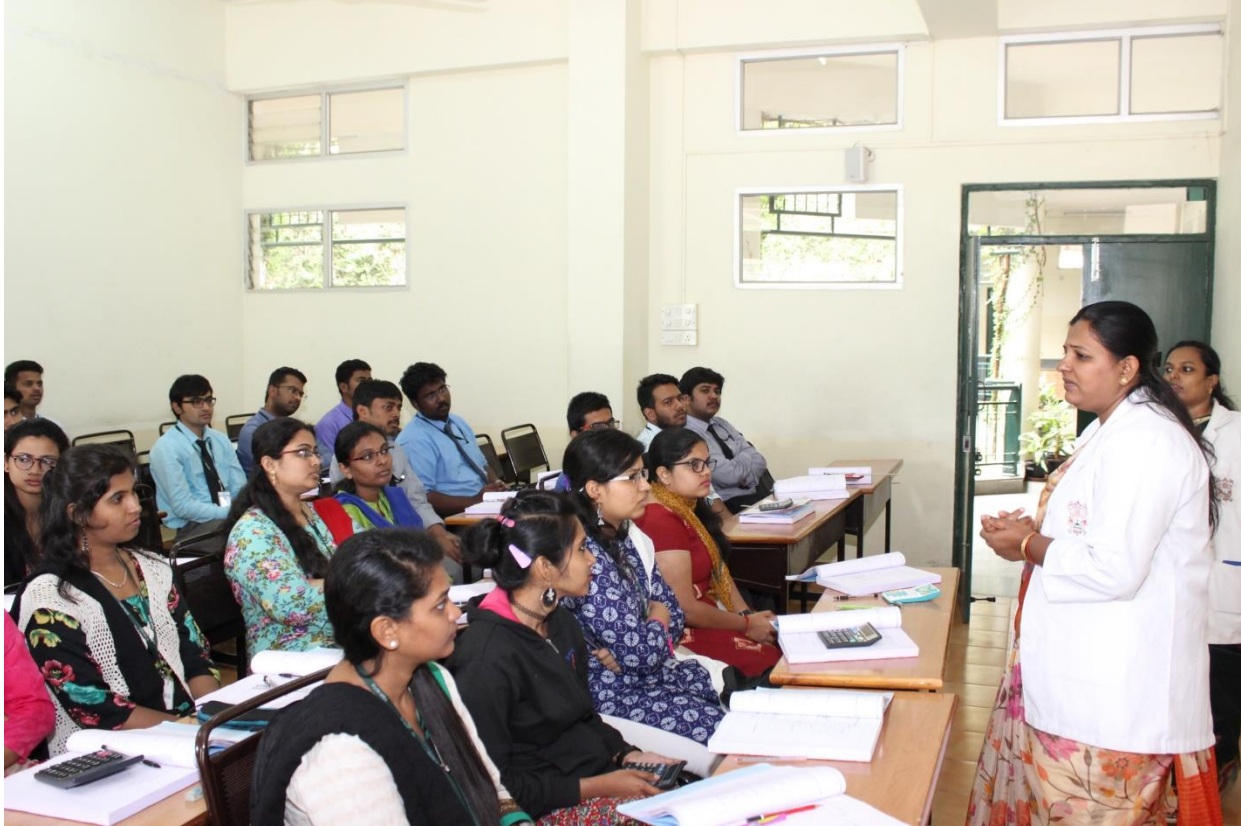
Awareness Programme in I Semester Sec B