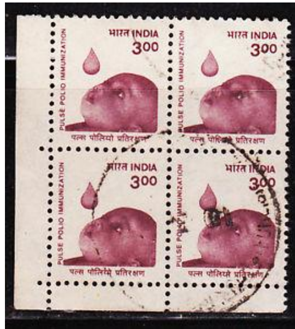
The Stamp was Model to inform Government Programmes