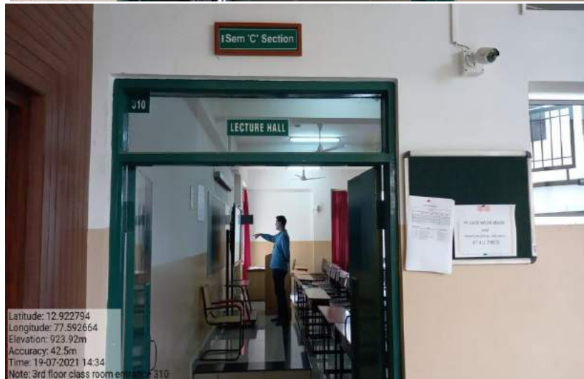
Latitude: 12.922794 Longitude: 77.592664 Elevation: 923.92m Accuracy: 42.5m Time: 19-07-2021 14:34 Note: 3rd floor class room entrance 310