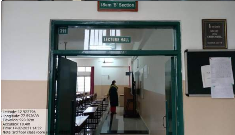
Latitude: 12.922796 Longitude: 77.592638 Elevation: 923.92m Accuracy: 18.4m Time: 19-07-2021 14:32 Note: 3rd floor class room