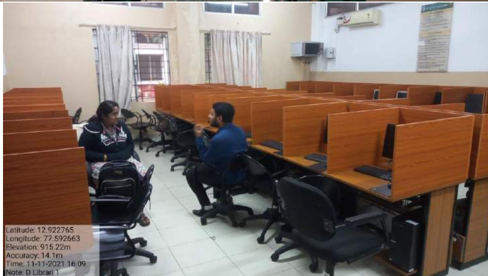
Latitude: 12.922765 Longitude: 77.592663 Elevation: 915.22m Accuracy: 14.1m Time: 11-11-2021 16:09 Note: D Librari 1