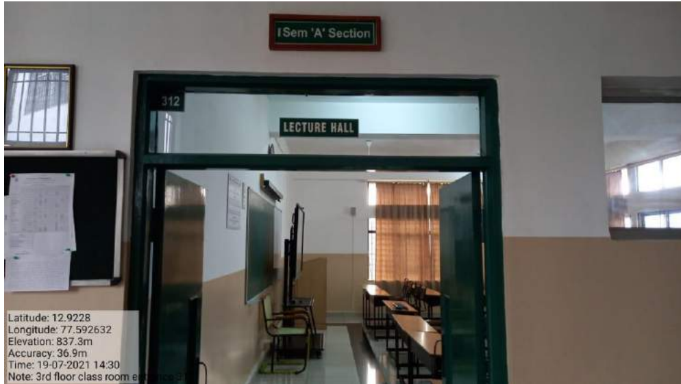
Latitude: 12.9228 Longitude: 77.592632 Elevation: 837.3m Accuracy: 36.9m Time: 19-07-2021 14:30 Note: 3rd floor class room e