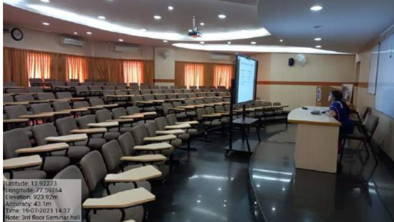
Latitude: 12.92273 Longitude: 77.59264 Elevation: 923.92m Accuracy: 43.1m Time: 19-07-2021 14:37 Note: 3rd floor Seminar hall