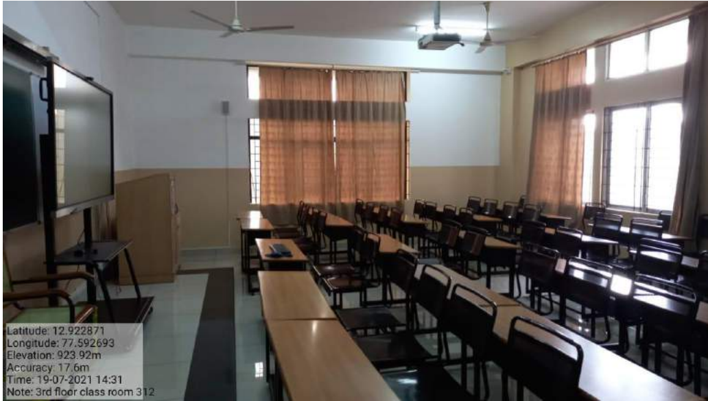
Latitude: 12.922871 Longitude: 77.592693 Elevation: 923.92m Accuracy: 17.6m Time: 19-07-2021 14:31 Note: 3rd floor class room 312