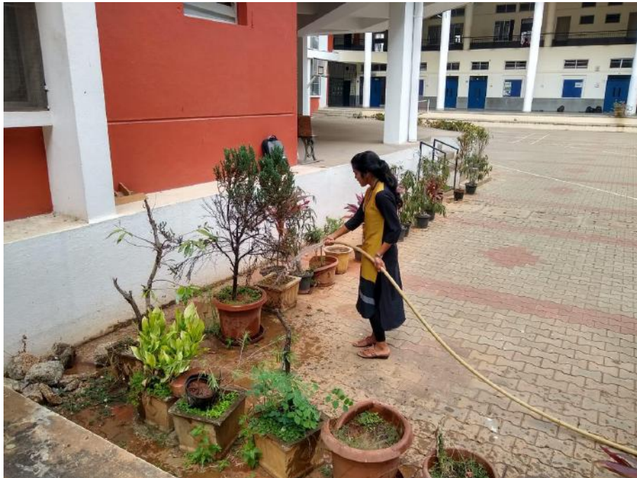
Students engaged in gardening activities to keep the campus green