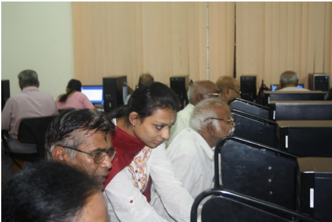
Student transferring necessary skills to use computers