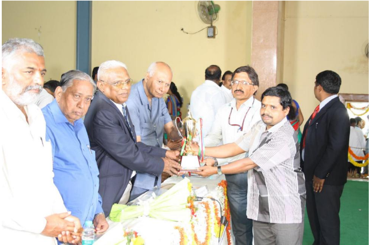
Gardner and Campus Maintenance Engineer receive award at Lal Bagh Flower Show

RVIM Green Garden has consistently is being awarded during Lal bagh Flower Show organised by the Horticultural Society.