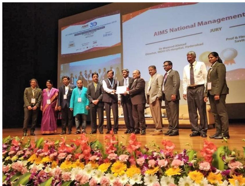
RVIM team members with Director receive award for best CSR Activities during National Management Week 2018

During National Management Week 2018 from August 1-7, 2018, RVIM had organized 13 programmes and reached 8500 people with 150 students and 20 staff members' participation. Addressed Star TV Suvarna Channel, Developed an App on Swachh Bharat & reached online learners using Massive Open Online Course (MOOCs). This achievement was recognized by Association of Indian Management Schools (AIMS) and was awarded . This recognition has positioned RVIM to be one among the Top three institutes in India for developing INNOVATIVE AND EFFECTIVE OUTREACH AND EXTENSION programmes.