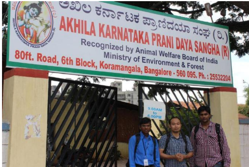
Photo 3 a: III Semester MBA students at the entrance of animal shelter