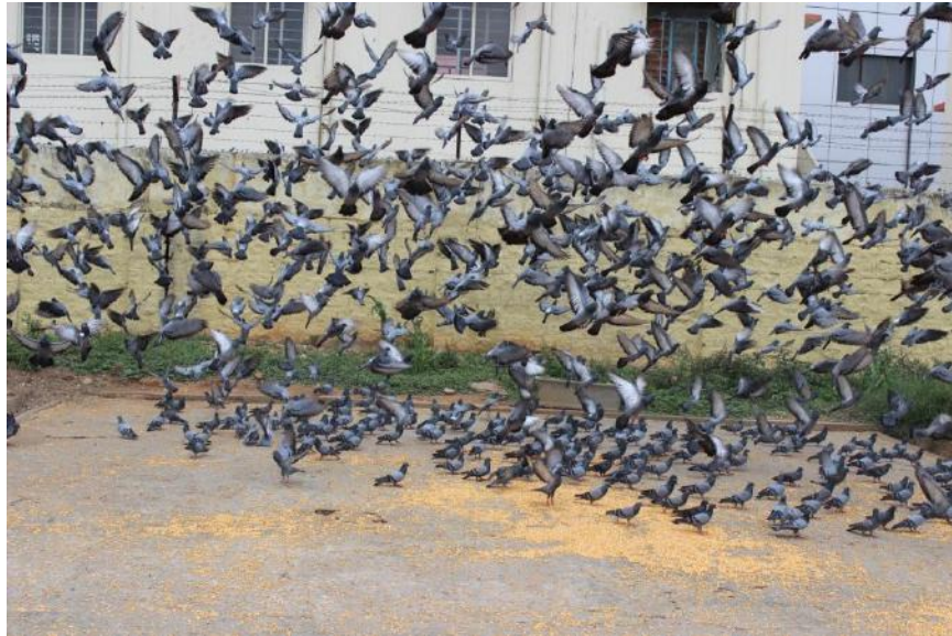
Photo 3 e: The lessons of-Live and Let Live really seen at the animal shelter