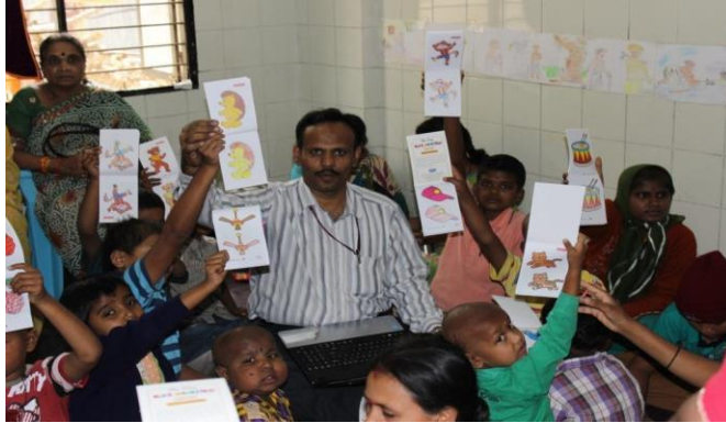
Photo 4 f: All children display their work at cancer hospital with pride along with Faculty and student volunteer