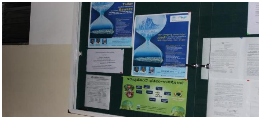
Photo 7a: Posters on pollution and ozone layer depletion displayed at RVIM Campus notice board