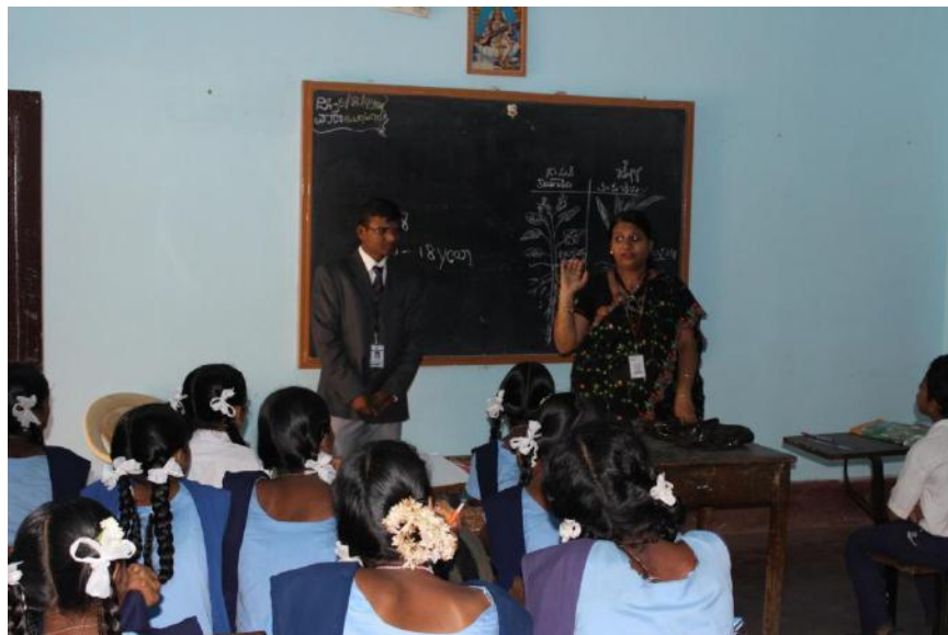
Photo 6g: Awareness class on- how the children should be vigilant?-

Connecting media report on child abuse and rape in India