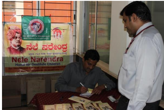
Photo 6 a: Faculty members and students contribute for destitute children orphanage-NELE