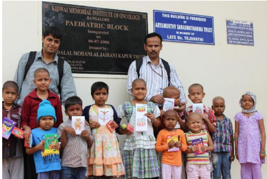
Photo 4a: Cancer Hospital Pediatric Ward -Children pose with their work with RVIM Volunteers