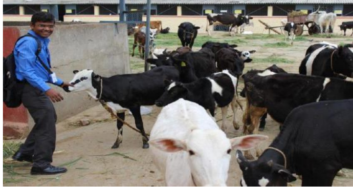
Photo 3c: Understanding the kindness that the dumb animals teach us