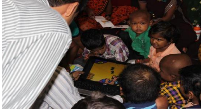
Photo 4c : Children watch cartoons at Kapoor Block -Cancer Hospital