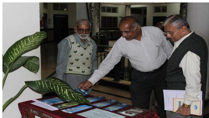
Photo 7b: Posters reached all the sections of the society and visitors in campus