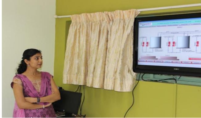
Photo 1 c: Plant Manager explaining the plant operations to RVIM students