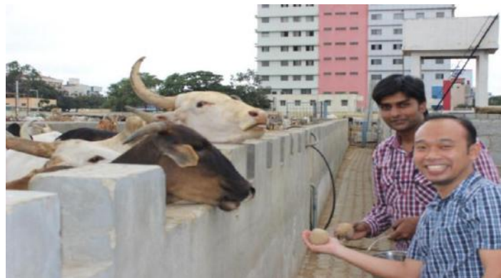
Photo 3d: Food for all-understanding the hunger in the deprived world