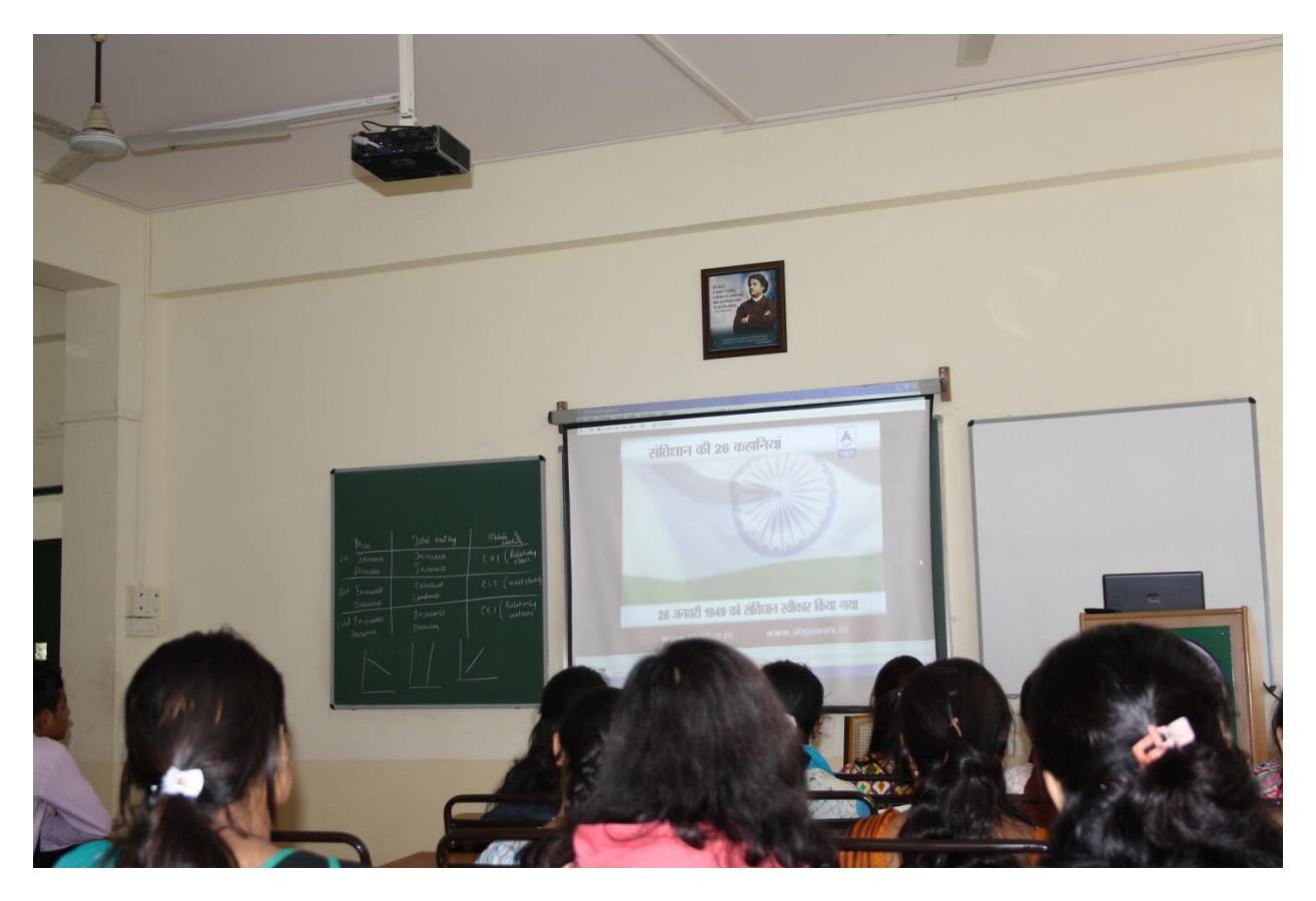
Screening of Documentary film /Media clip Making of the Indian Constitution