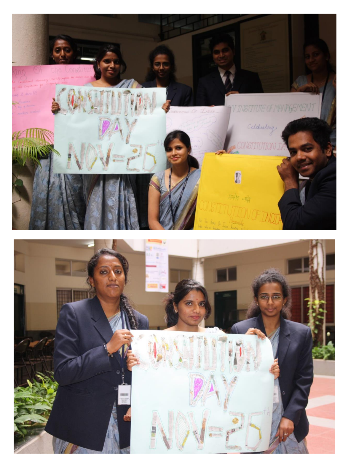
Posters and Collages marked the Day