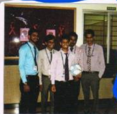
Student volunteers participating in Aids Awareness Campaign 2015