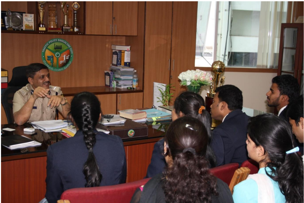
Interview with ACP Traffic