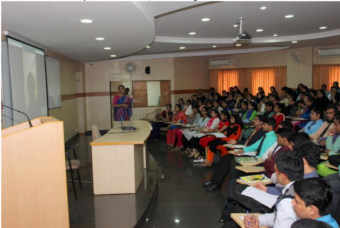
Students interact through video conferencing mode from RVIM Campus