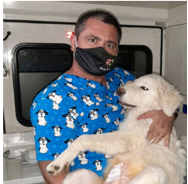
ANIMED ARAD, Romania

Meet the winners of the World Animal Day grant