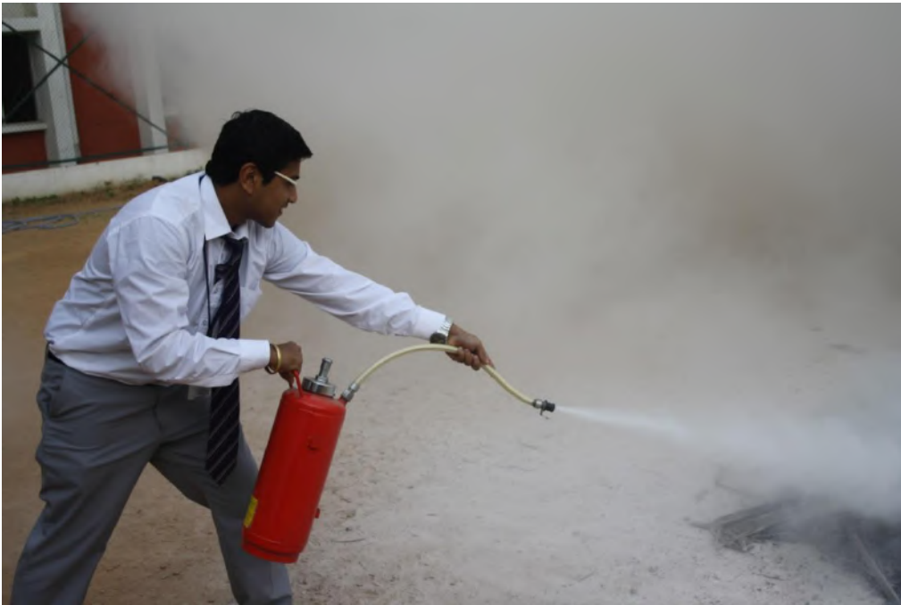
Students try to manage independently to extinguish the fire