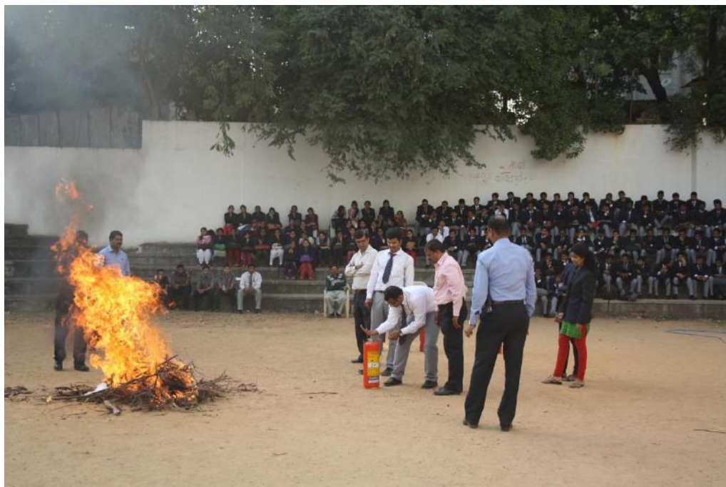
Guided Training Session to a student