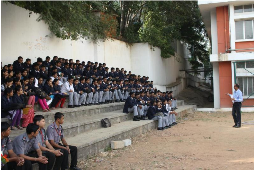
Theoretical Briefing Session