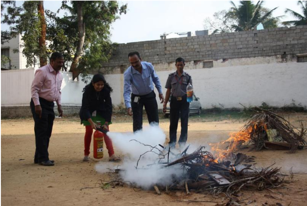
Guided Training Session