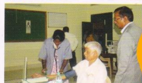
Senior Citizens undergoing Health Check up during the camp