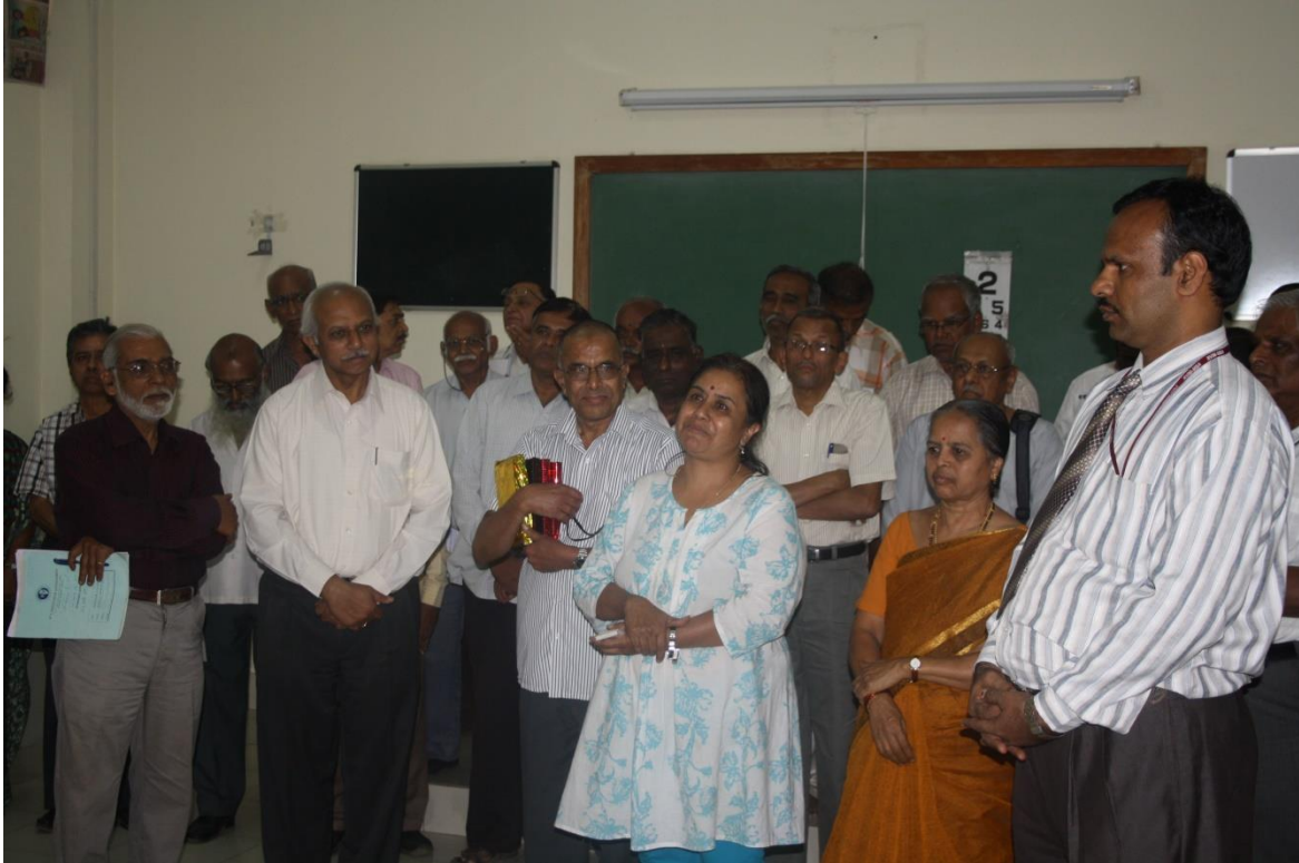
Inauguration of the Camp