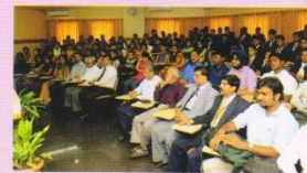
Audience in the Inaugural Programme of Prestantia 2014