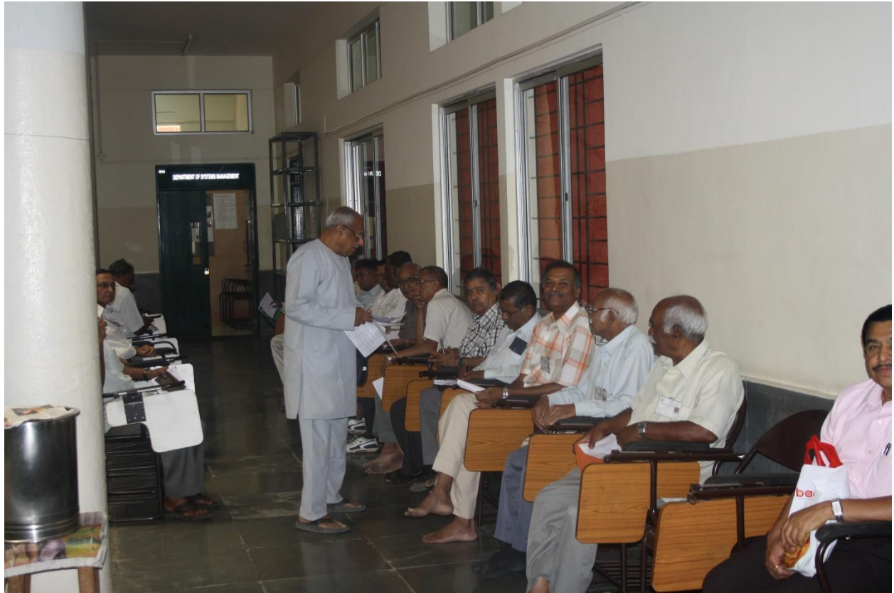
Beneficiaries of the health camp