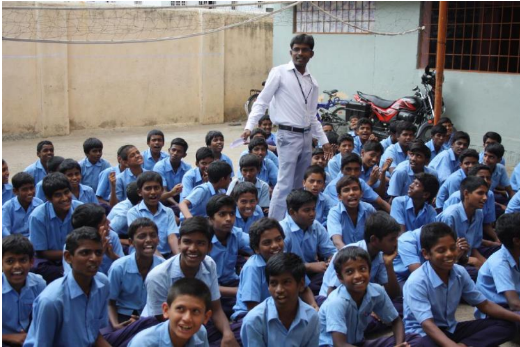
POCSO and Emergency number-Class activity