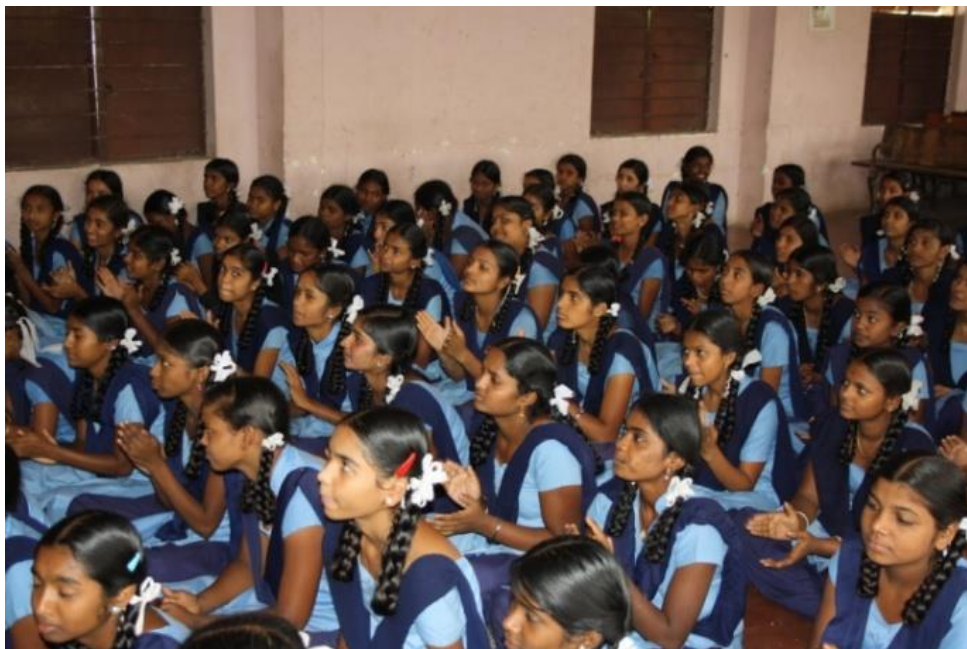
Girls Group listening to AIDS awareness Programme