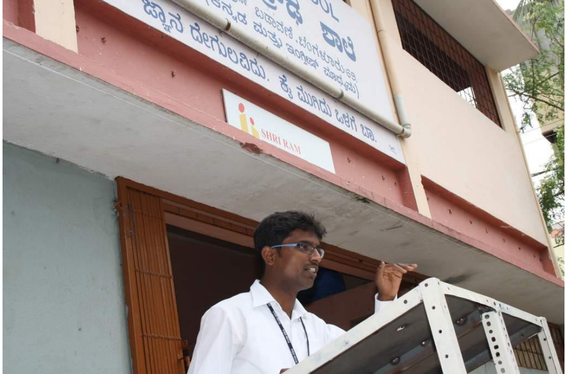
Student Volunteers are thanked by the school children