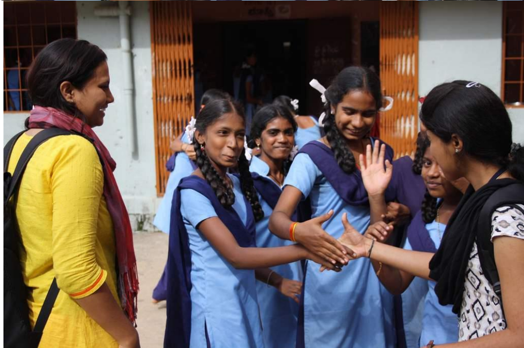
Student Volunteers are thanked by the school children