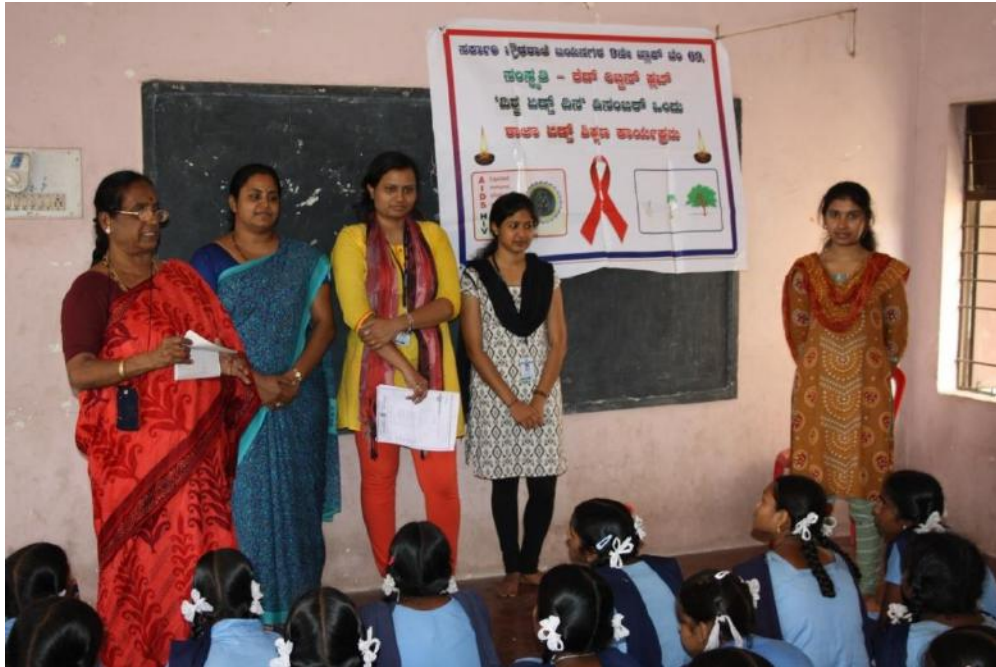
AIDS awareness class at Government High School. (RVIM Team Introduced)