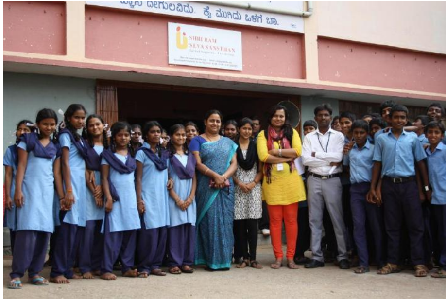
Vote of Thanks at Government High School