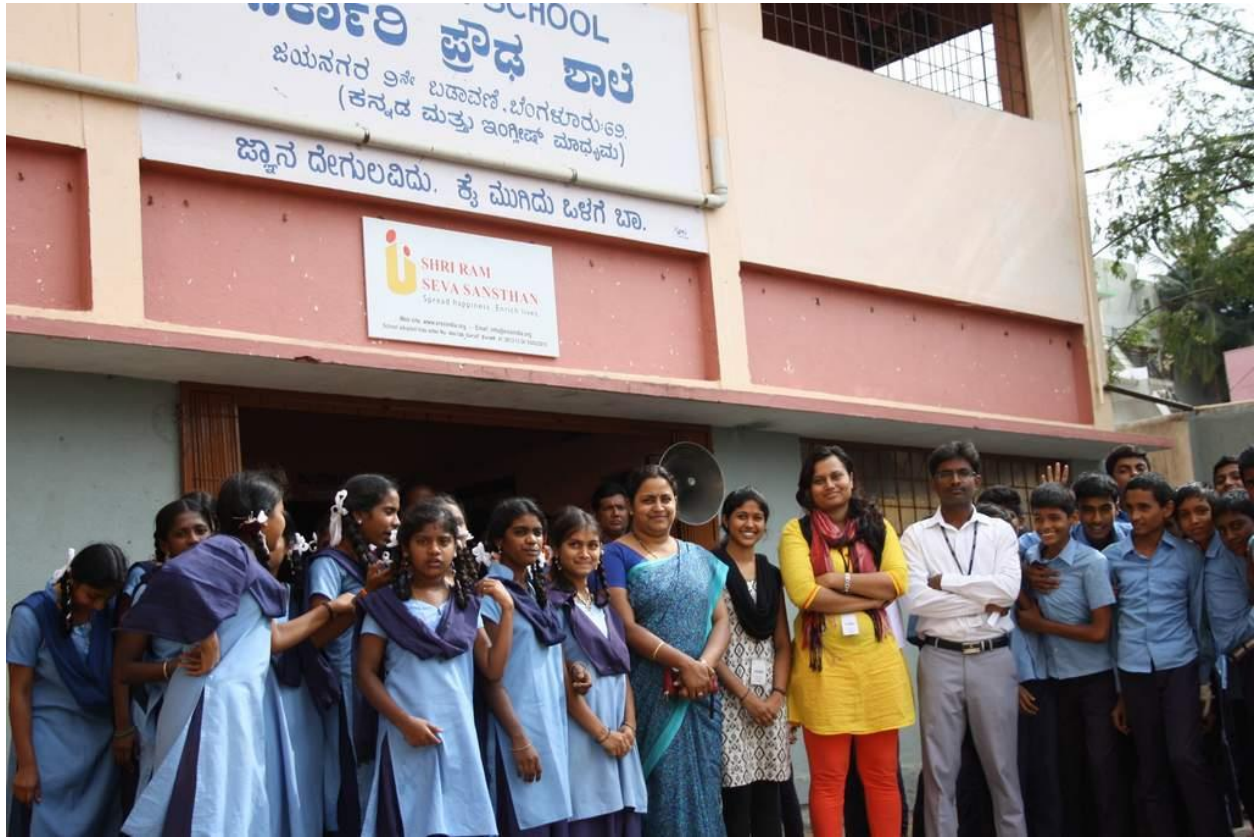
Closer View of Group Photo