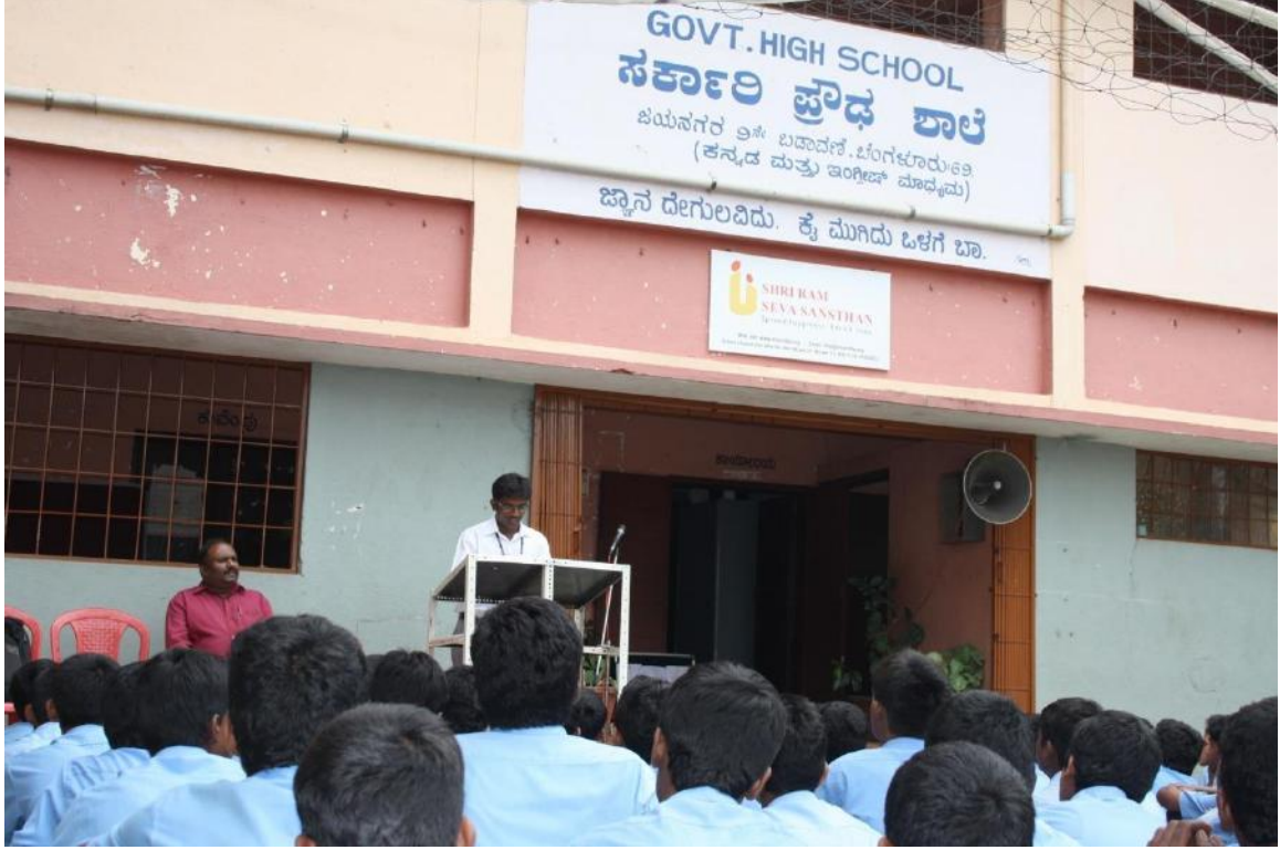
RVIM Student Volunteer on AIDS awareness for Boys Group