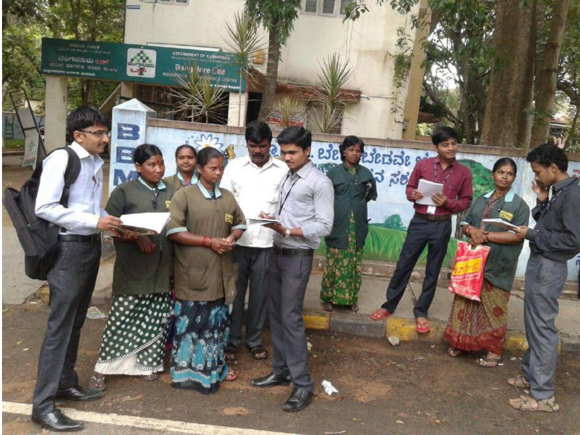
Photo 3: Pourakarmikas are taught to write their name and sign at BBMP J'Ngr