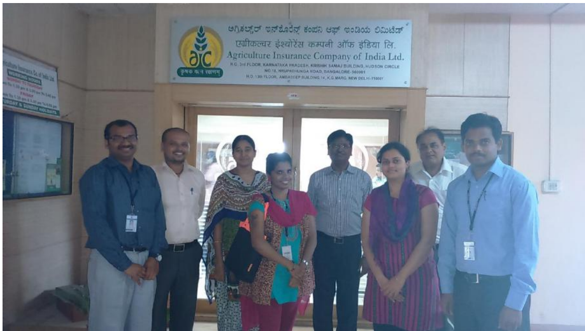
Photo 16: Agriculture and rural support. Student volunteers training.

The visit was very useful to learn about the various schemes and their reach to the people.