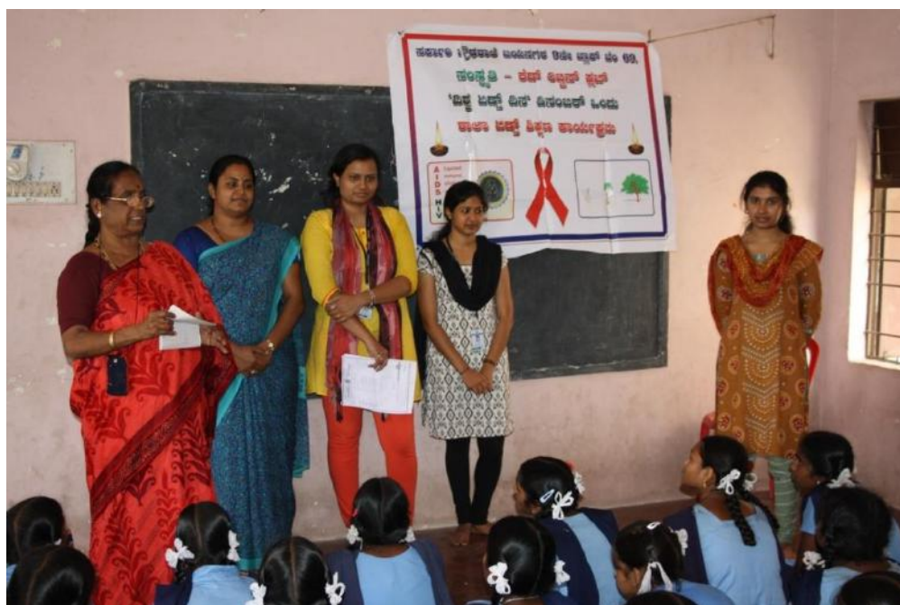
Photo 6: AIDS awareness class at Government High School. (RVIM Team Introduced)