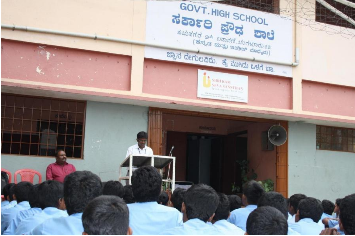
Photo 8: RVIM Student Volunteer on AIDS awareness