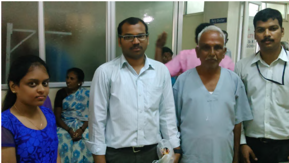
Photo 12: RVIM Student volunteers escorting the patient at Eye Hospital