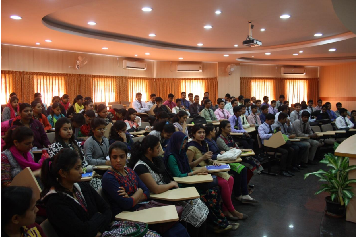
Documentary film on AIDS was screened for the Combined Session