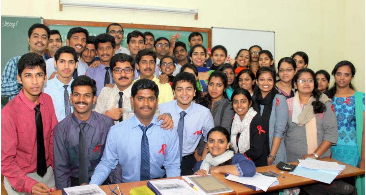
AIDS Day Awareness Programme in the campus was organized by all the students of I Semester MBA Section 'C'