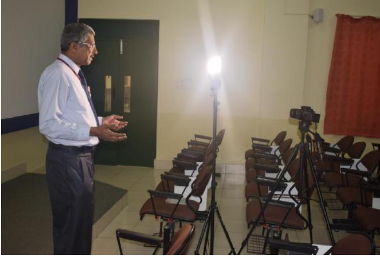
Photo 14: Preparation of Training for Managers and Business Proprietors through MOOCs