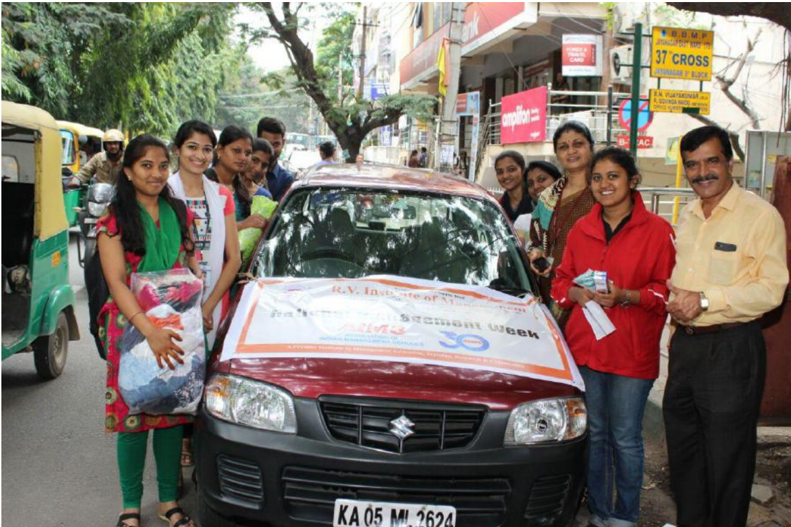
Photo 10:Staff Car used for collection of materials. Team at the end of Collection of materials