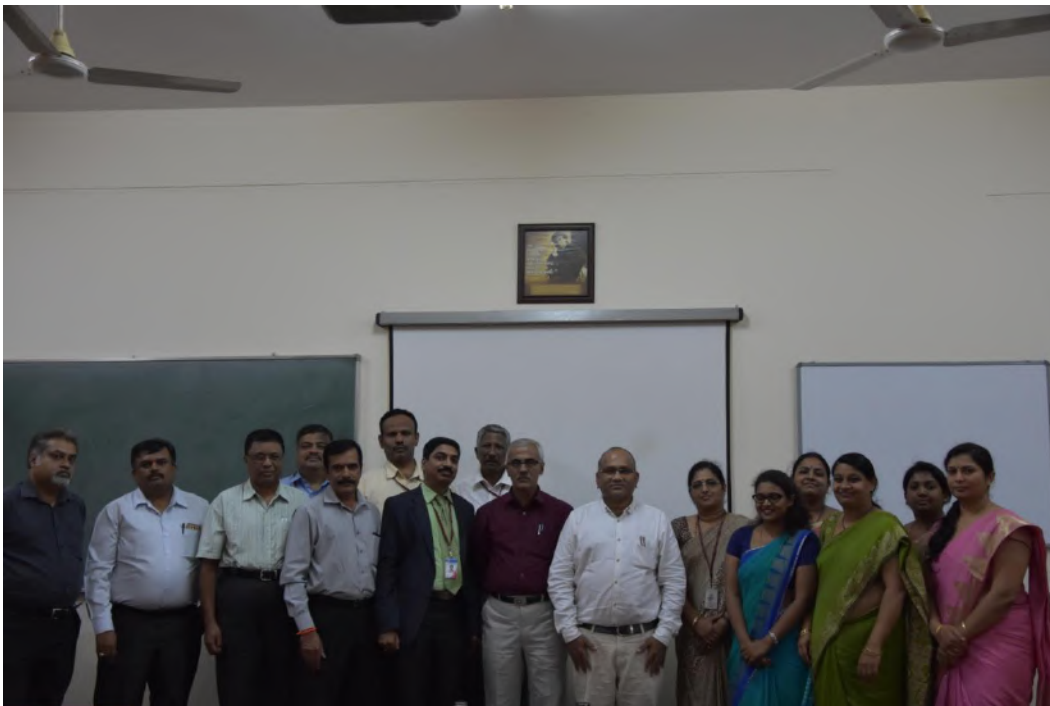
Photo 21: Director RVIM and Principal RVCE with faculty members on the last day of National Management Week 2018