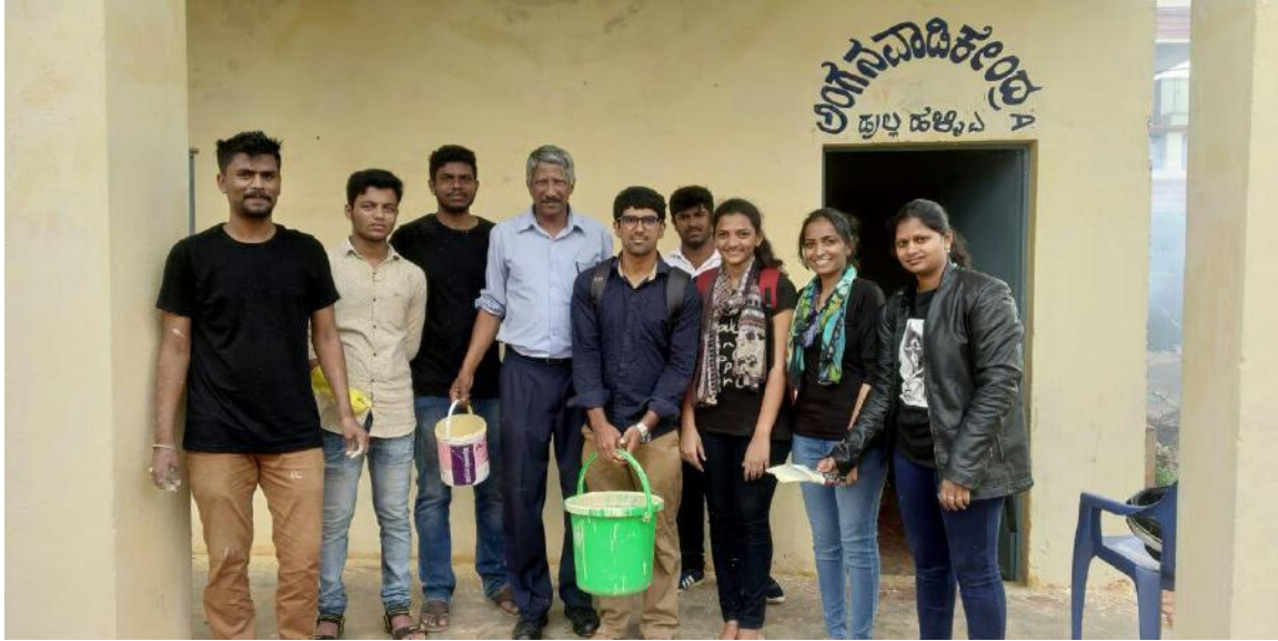
Photo 2: Painting of Anganwadi School Wall in Hullahalli Village-Team with Coordinator