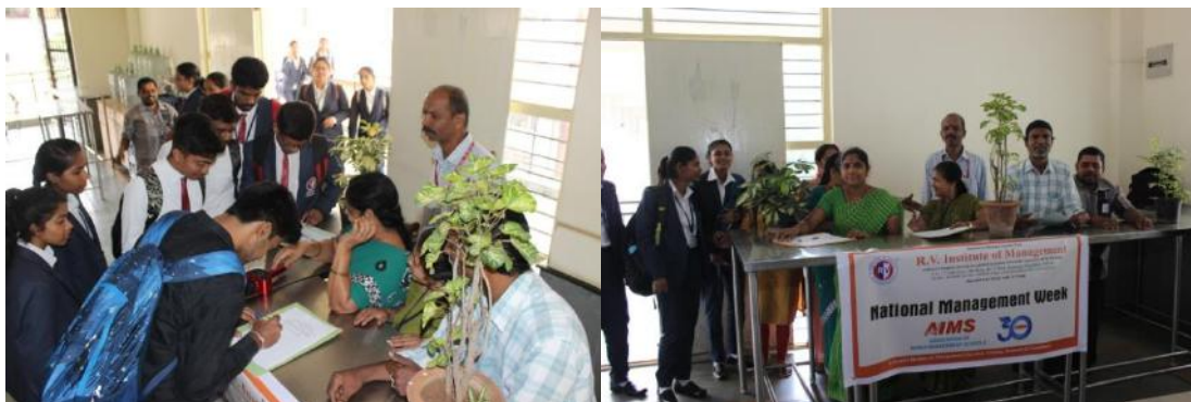
Photo 5: Awareness programme to promote Vertical and Terrace Gardens at Home

The concept of Vertical garden, Terrace garden is spreading in urban environment due to lack space. Awareness is lacking. Helper Staff with college Gardner and Faculty members organized an awareness programme to develop garden in every homes. Students were approached in the college canteen during lunch time. A total of 445 students in the campus took a pledge to grow plants in their homes.