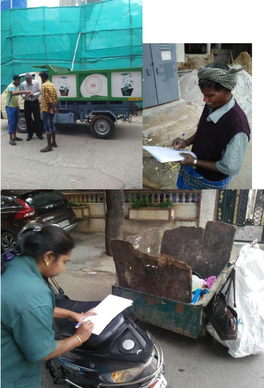
Photo 12: Teaching sweepers, municipality workers to write and sign

Reading, writing and signing is a great effort for the people working in hygiene departments and unorganized sectors. Teaching to write names and sign was embarked on this day.