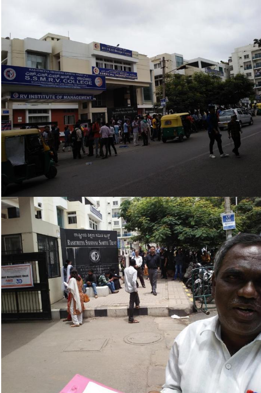
Photo 13: Generation of ideas for MOOCs Training Programme through Focused Group Interviews

Parents waiting outside an examination centre were approached to gather ideas for waste segregation. This information is used to develop MOOCs and Online Programmes for educationalists, managers and tiny business proprietors.