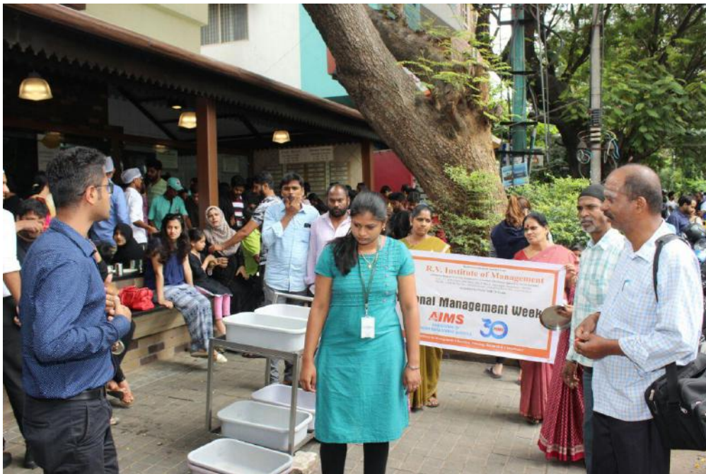
Photo 8: Street Play to create awareness about recycling and inform the residents regarding door to door collection of materials and Collection center in Campus