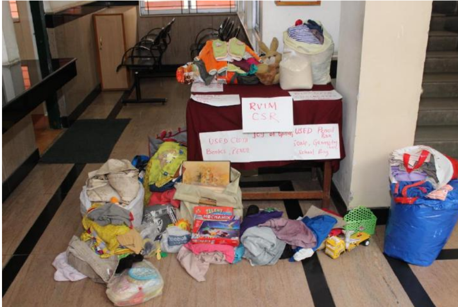
Photo 7: Faculty and Students deposited materials for orphanage in the campus

RVIM collected cloths, papers, stationeries, toys for the orphanage. Orphanage by name 'Astha Sakti' is a home for 2000 orphan and underprivileged children. All the materials were delivered to the orphanage.