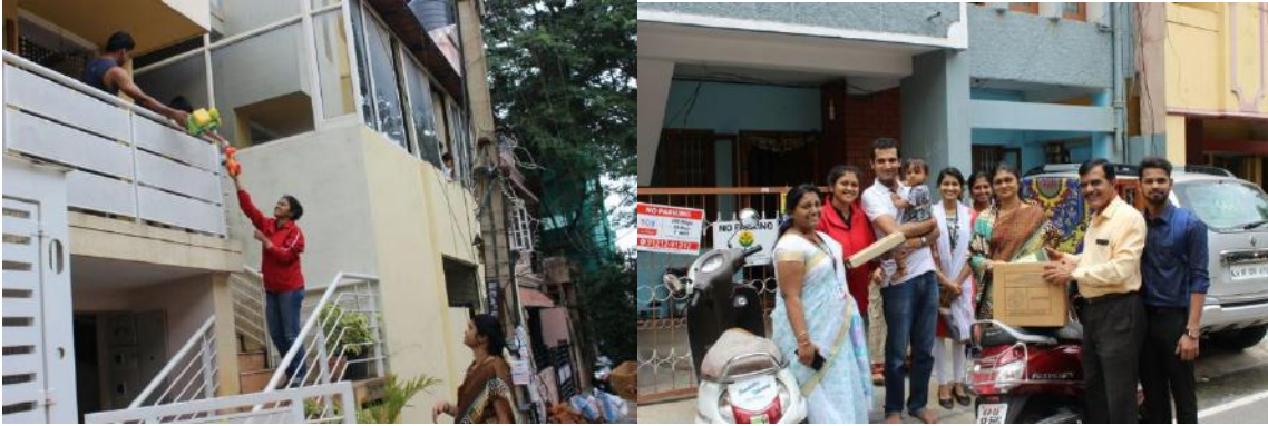
Photo9: Faculty and Student collecting toys and stationeries from residents of Jayanagar