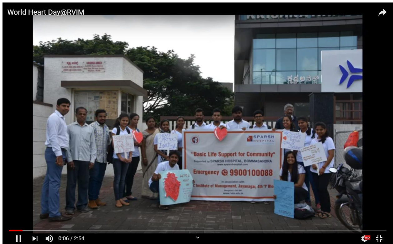
RVIM Students Group