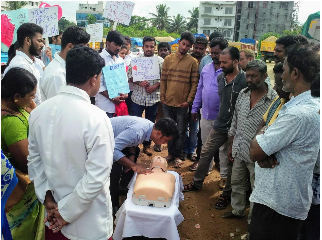
BLS Demonstration in Hosur Road