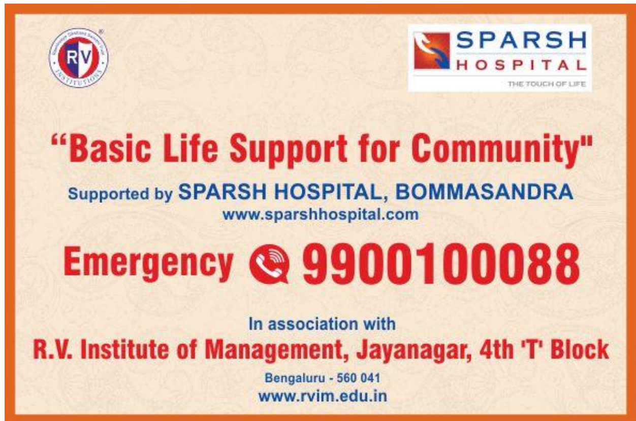
Banner for the awareness programme

Around 10 street plays were conducted near community gathering and reach more than thousand people. In companies TVS, Dechathlon, Enfield India –the manager permitted all their employees to view the BLS Training as it was very essential to them.