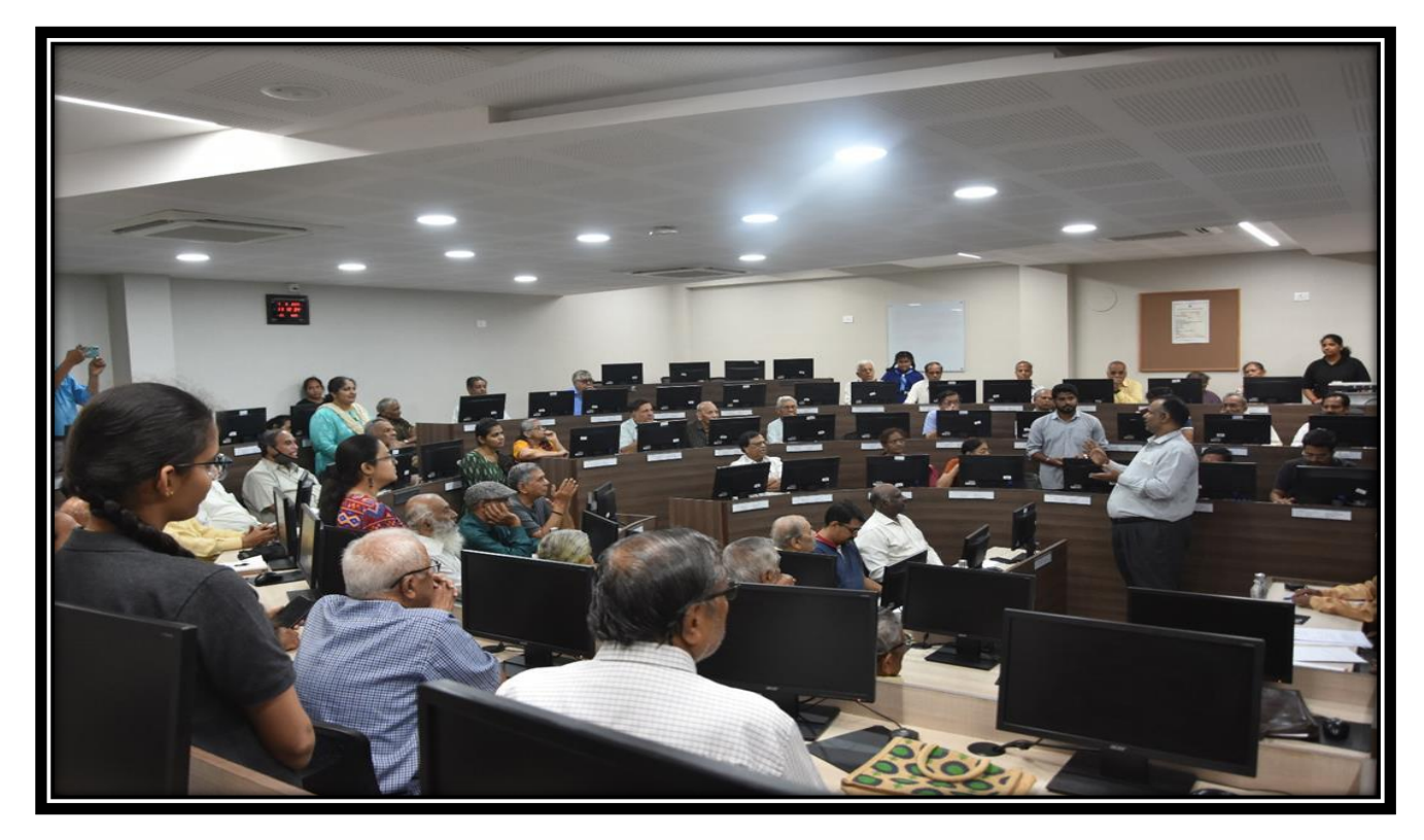
Showing: RVIM staff members and students, with senior citizens of Swasahaya Trust in workshop on August 5, 2023