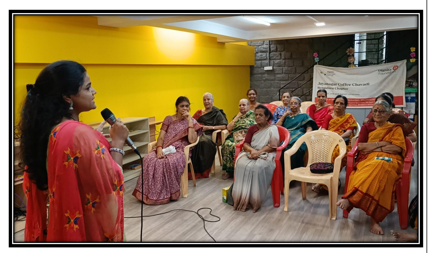
Showing: RVIM staff member entertaining the senior citizens of Dignity Foundation on August 7, 2023