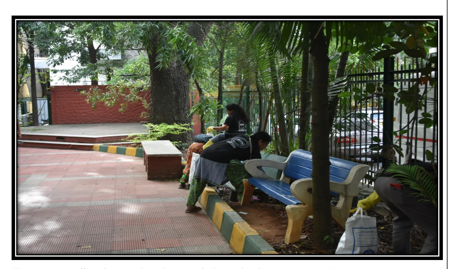
Showing: RVIM staff members & students cleaning parks during Plogathon on August 6, 2023