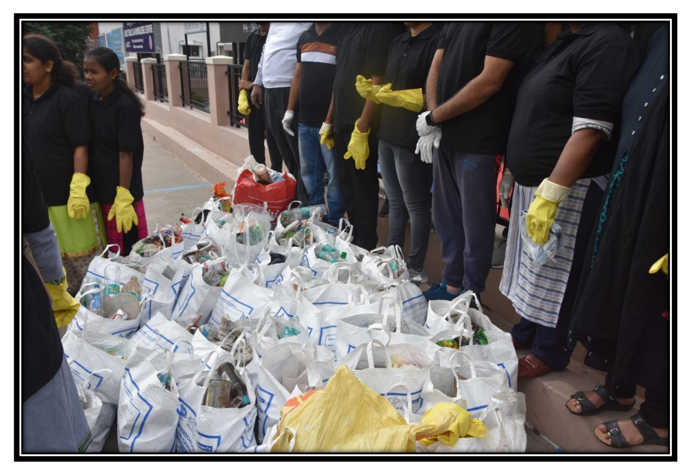
Showing: Waste collection during Plogathon on August 6, 2023