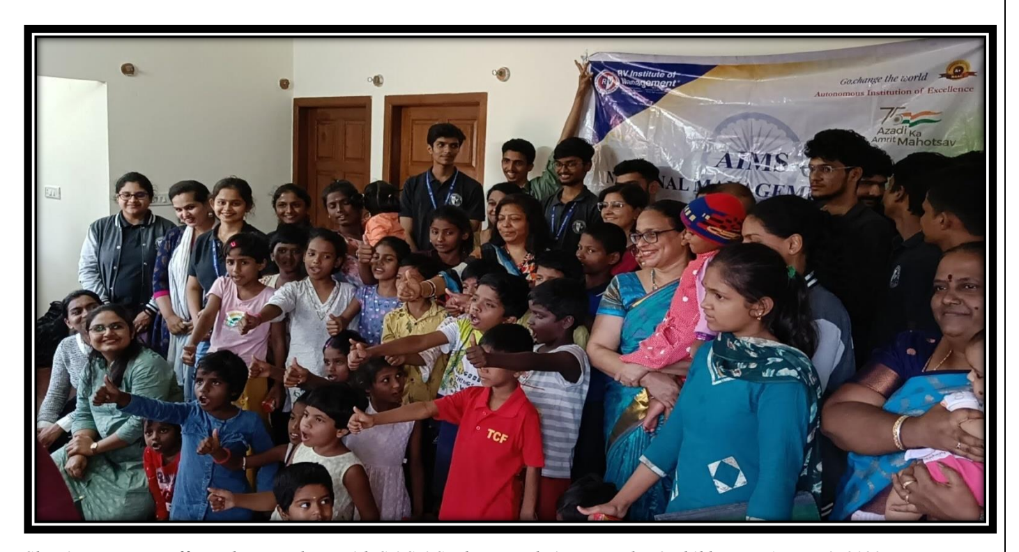
Showing: RVIM staff members, students with Sri Sai Sneha Foundation Founder & children on August 3, 2023

This event was organized to inculcate social awareness among the students and sensitize them towards the under privileged children in the society. It was a meaningful way to support and make a positive impact on the lives of orphaned children.