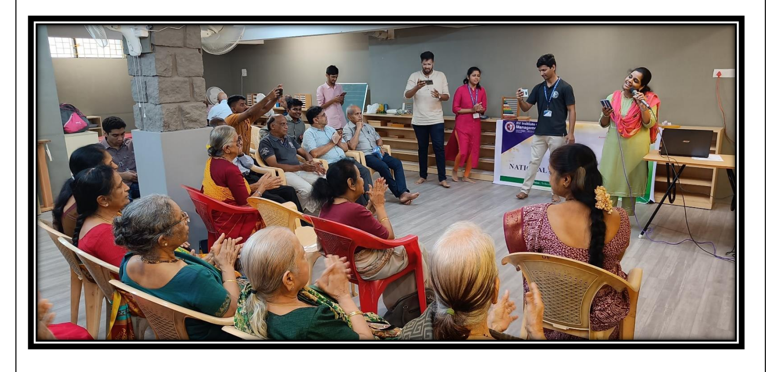
Showing: RVIM staff members & students with Dignity Foundation on August 7, 2023