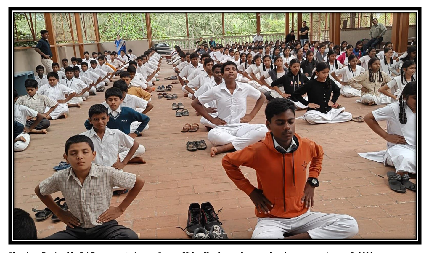
Showing: Ragigudda Sri Prasanna Anjaneya Swamy Vidya Kendra students performing yoga on August 5, 2023