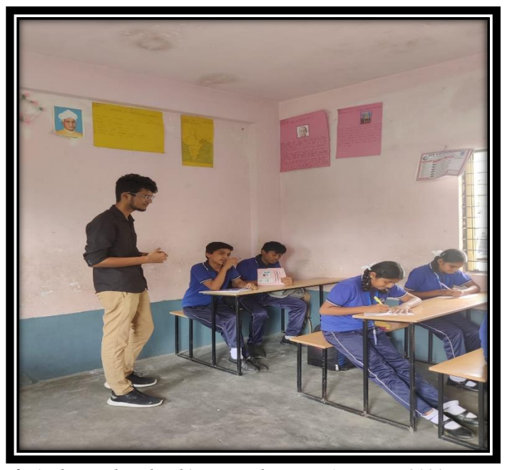
Showing: RVIM students volunteering with the young minds of Vivekananda school in Bengaluru, on August 5, 2023