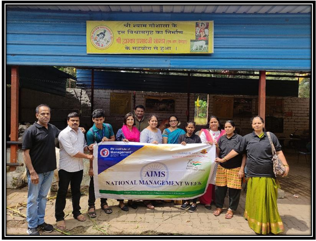
Showing: RVIM staff members, students With Shri Shyam Goshala members on August 3, 2023