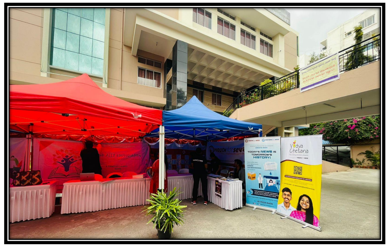
Showing: NGO stalls in the premises of RVIM on August 5, 2023