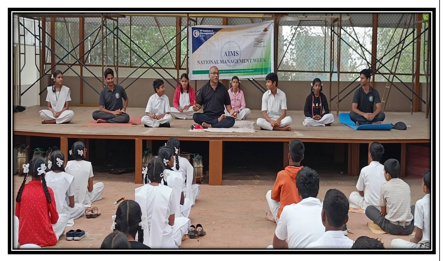
Showing: RVIM Director and students training yoga to young minds on August 5, 2023