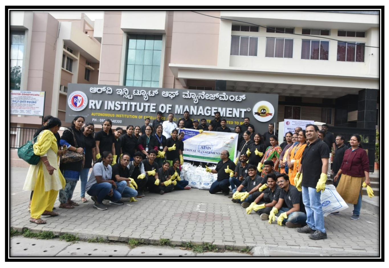
Showing: RVIM Director, staff members & students with ITC-Wow, waste collection during Plogathon on August 6, 2023