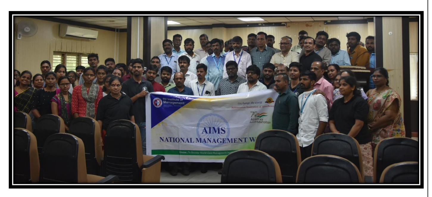
Showing: RVIM Director, staff members, students, BBMP Authorities and workers in Financial Literacy program on August 4, 2023