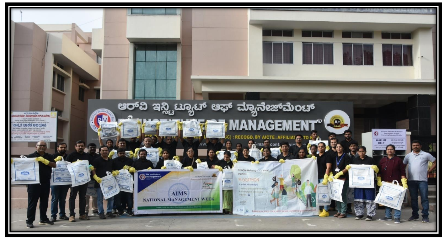
Showing: RVIM Director, staff members & students with ITC-Wow, participating in Plogathon on August 6, 2023