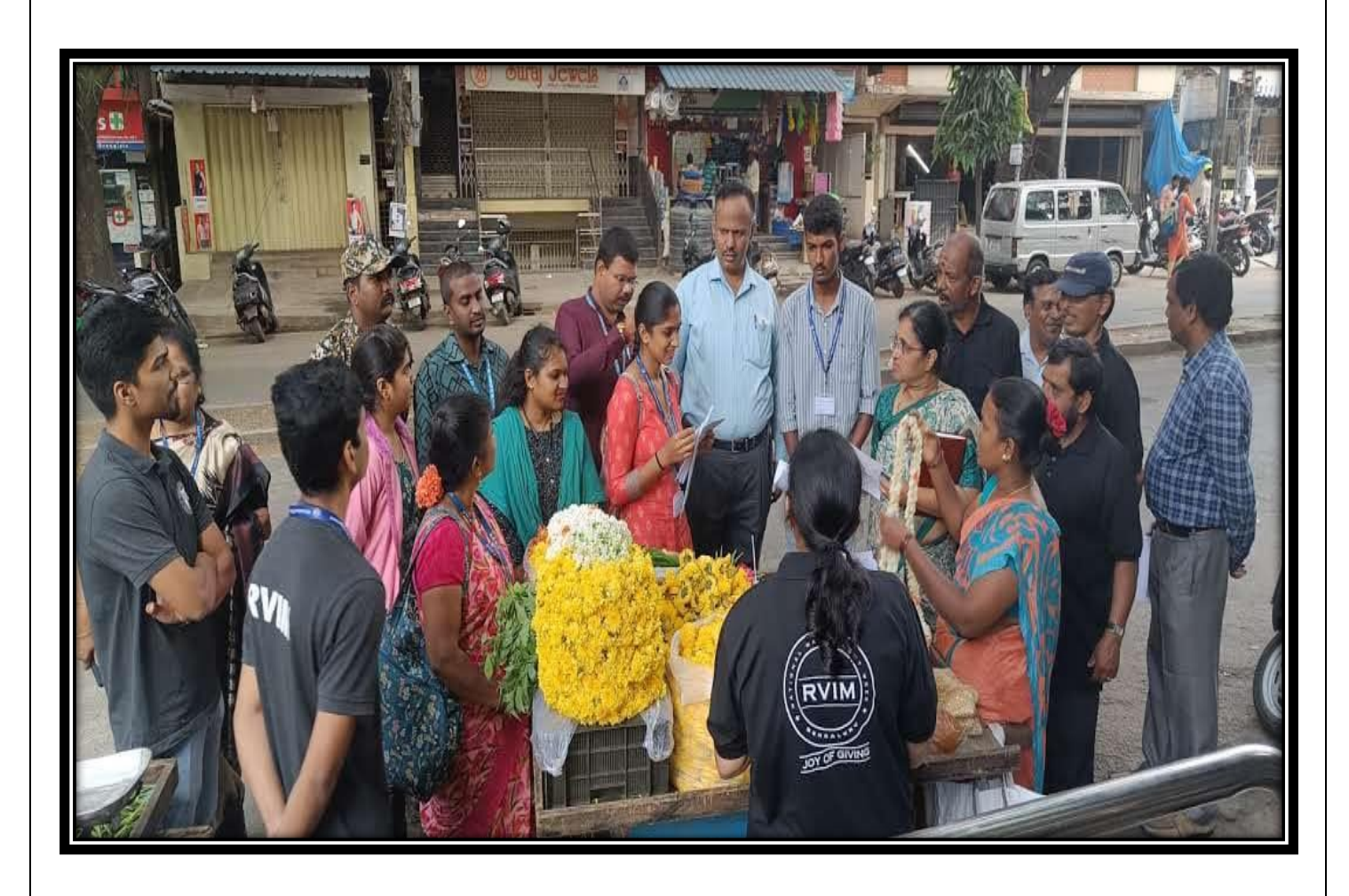
Showing: RVIM staff members, students & BBMP Authorities participating in Awareness among Street Vendors regarding Fair Trade Practices in Association with BBMP on August 4, 2023