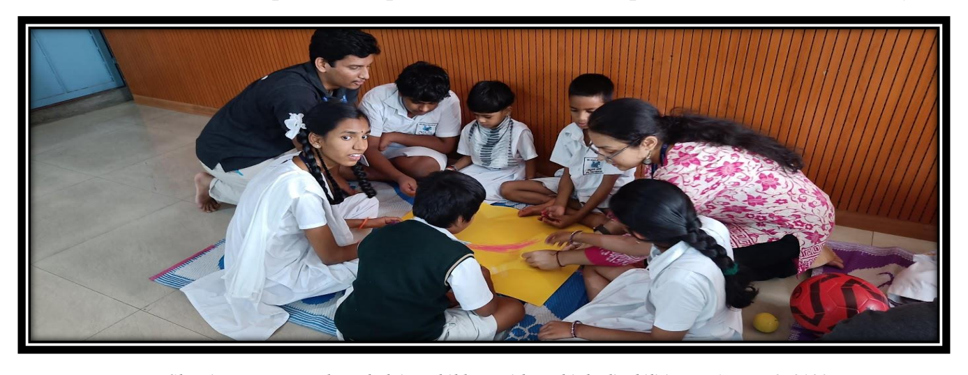
Showing: RVIM students helping children with multiple disabilities on August 2, 2023

After the group games, each child had the opportunity to showcase their individual talents in singing and dancing. This kind of talent showcase not only boosts the children's self-confidence but also provides a platform for them to express themselves creatively.