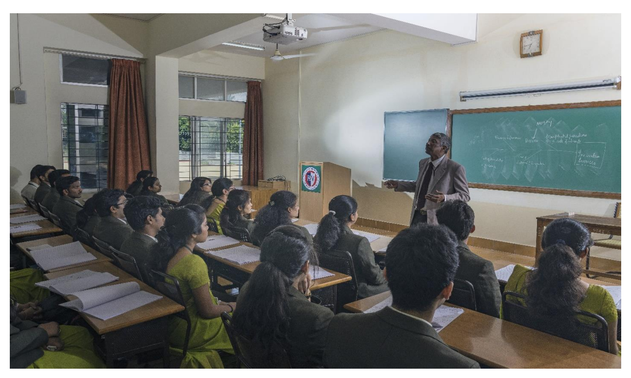
ICT Enabled Class rooms, Seminar hall, Conference hall, MDP cell and Board room Class rooms