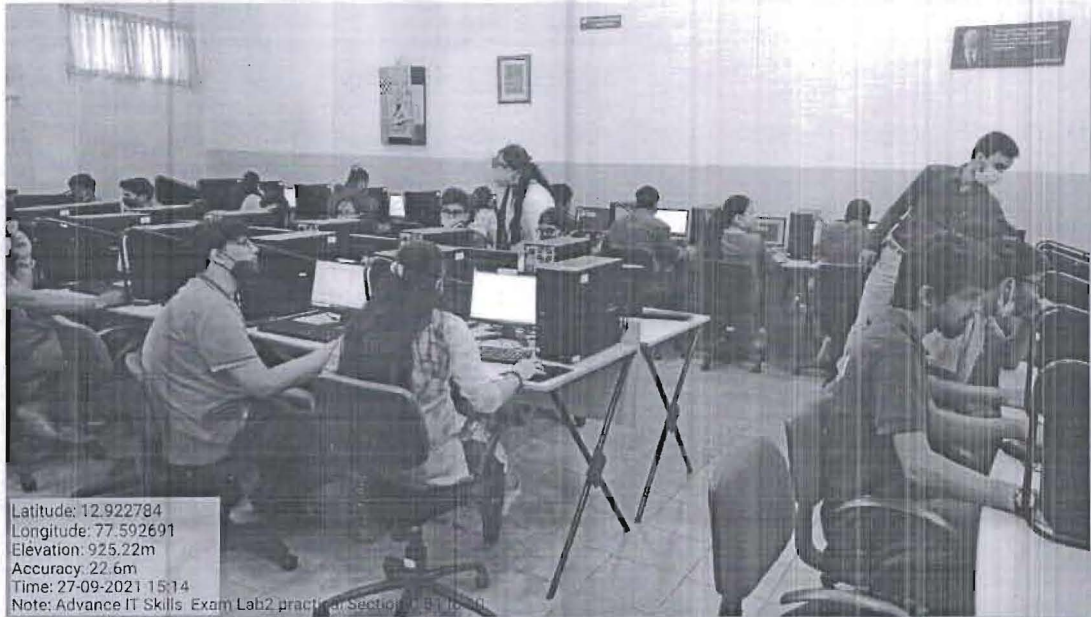
Latitude: 12.922784 Longitude: 77.592691 Elevation: 925.22m Accuracy: 22.6m Time: 27-09-2021 15:14 Note: Advance IT Skills Exam Lab2 practical Section 9.1 to 9.4