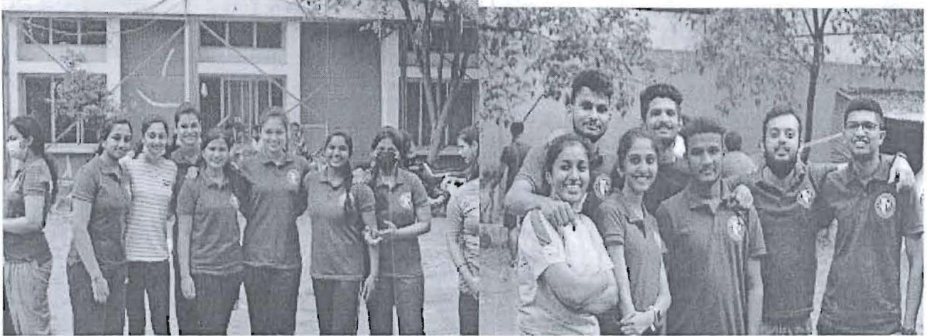
III semester students cheering and encouraging the staff members during the tug of war match.