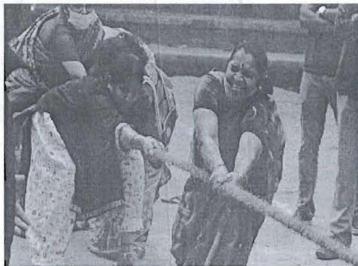
Runners up team