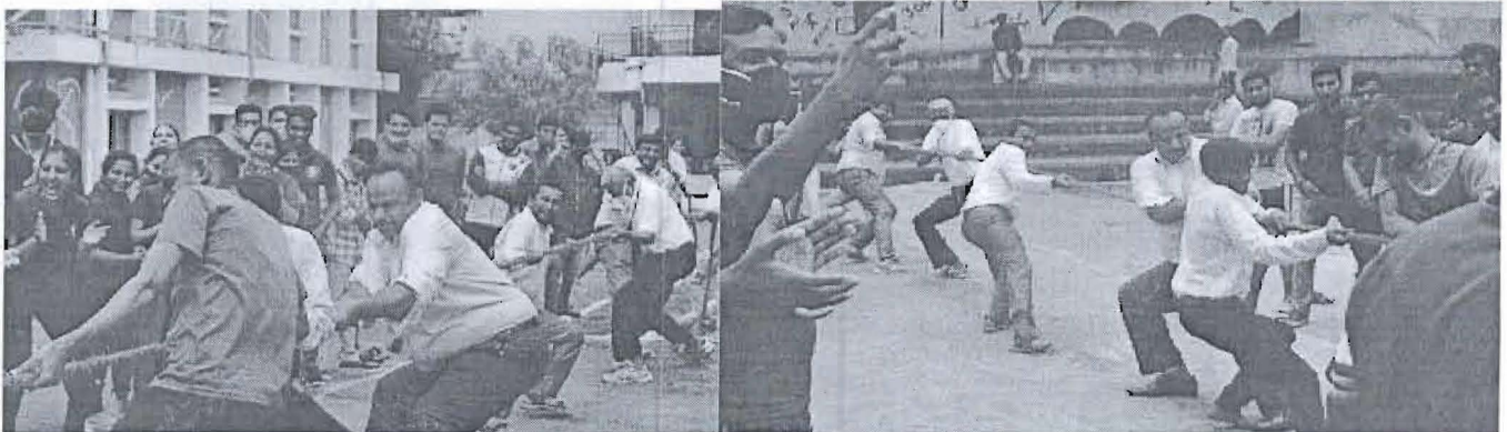
Winners of Tug of War