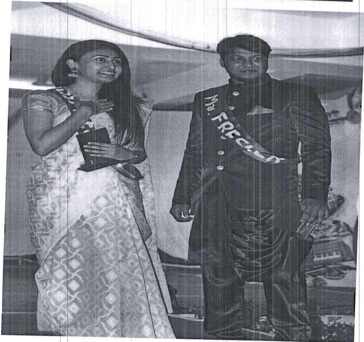
Mr. Fresher and Miss Fresher 2019