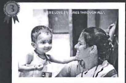
AJEY M I SEM 'A'