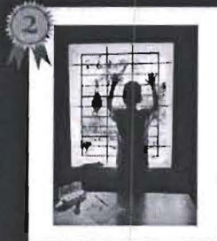
KEERTHAN KAMATH IV SEM 'B'