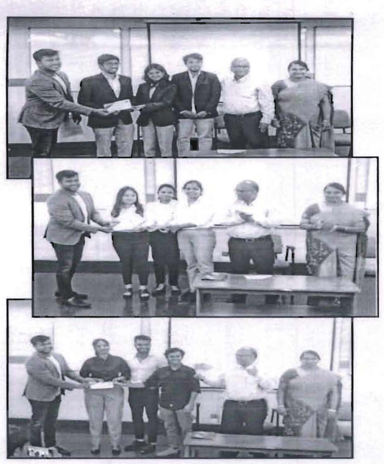
Winners of the event