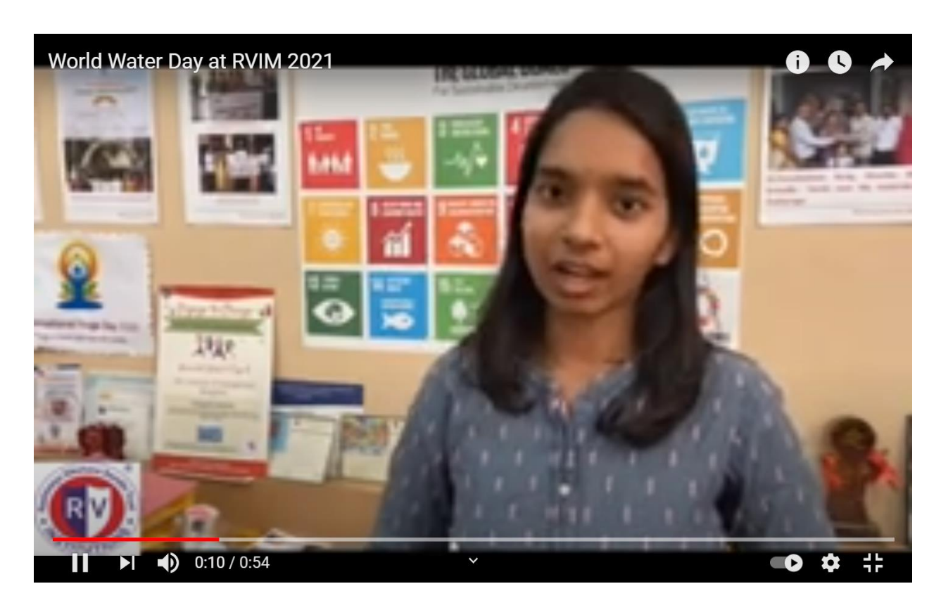
Message in Telugu