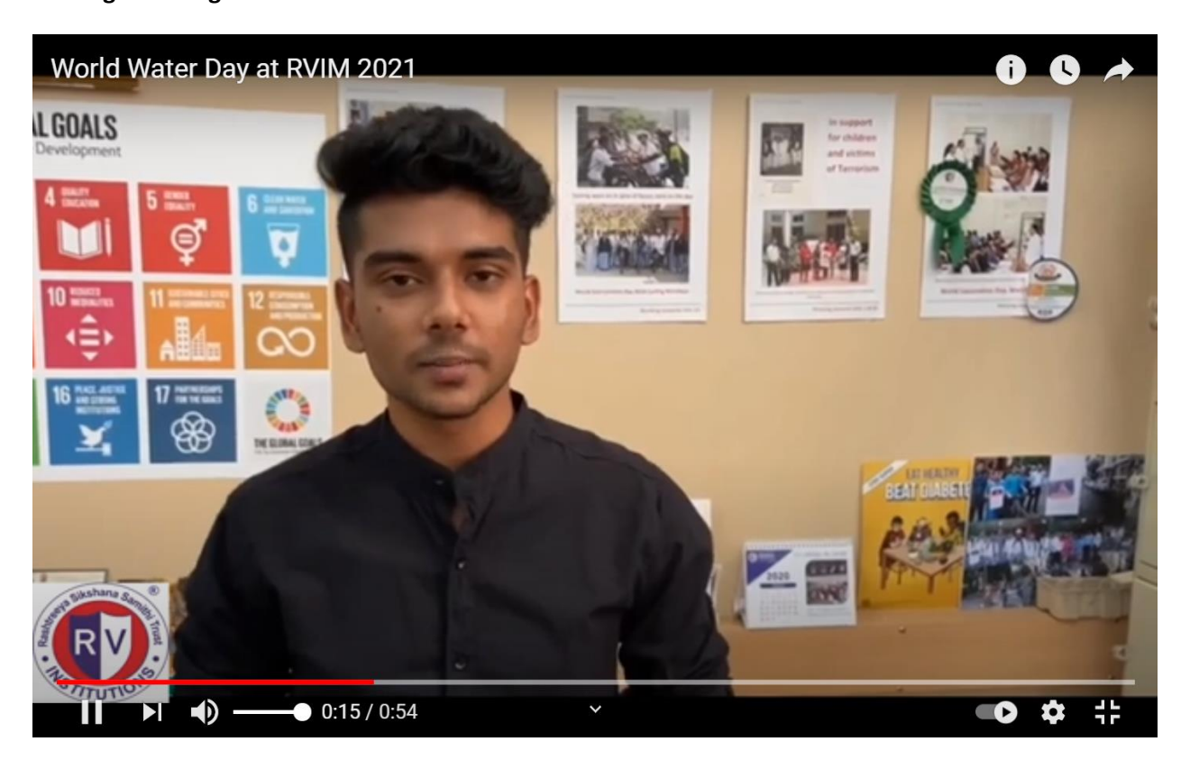
Message in Malayalam