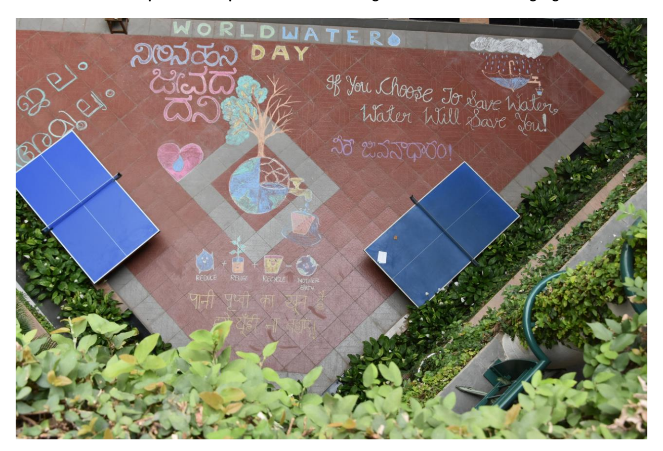
Floor Art on Water Conservation

World Water Day was celebrated on March 22. A batch of student's team from I Semester MBA 'C' created floor art in the campus. The message was very clear with text and picture. It is presumed that around 250 members would have seen and read the message line as it was visible from all the floors. Later a short video clip was developed to reach the message in other vernacular languages.