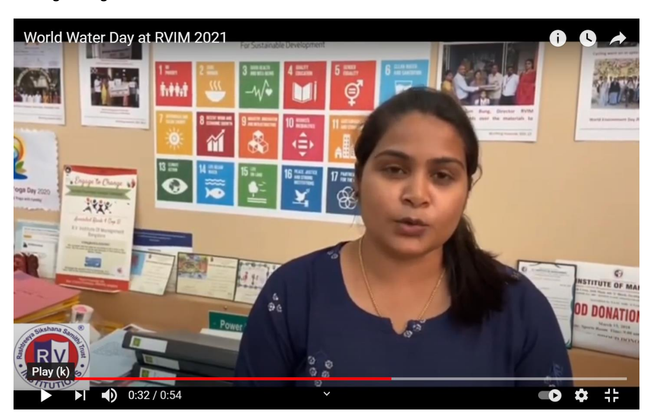
Message in Hindi