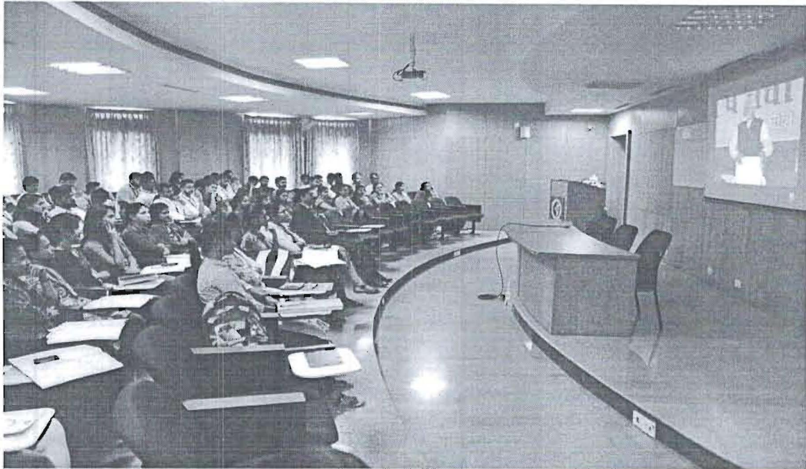
Students and Faculty Members of R V Institute of Management participated in "Pariksha Pe Charcha 2.0" programme on 29 th January 2019