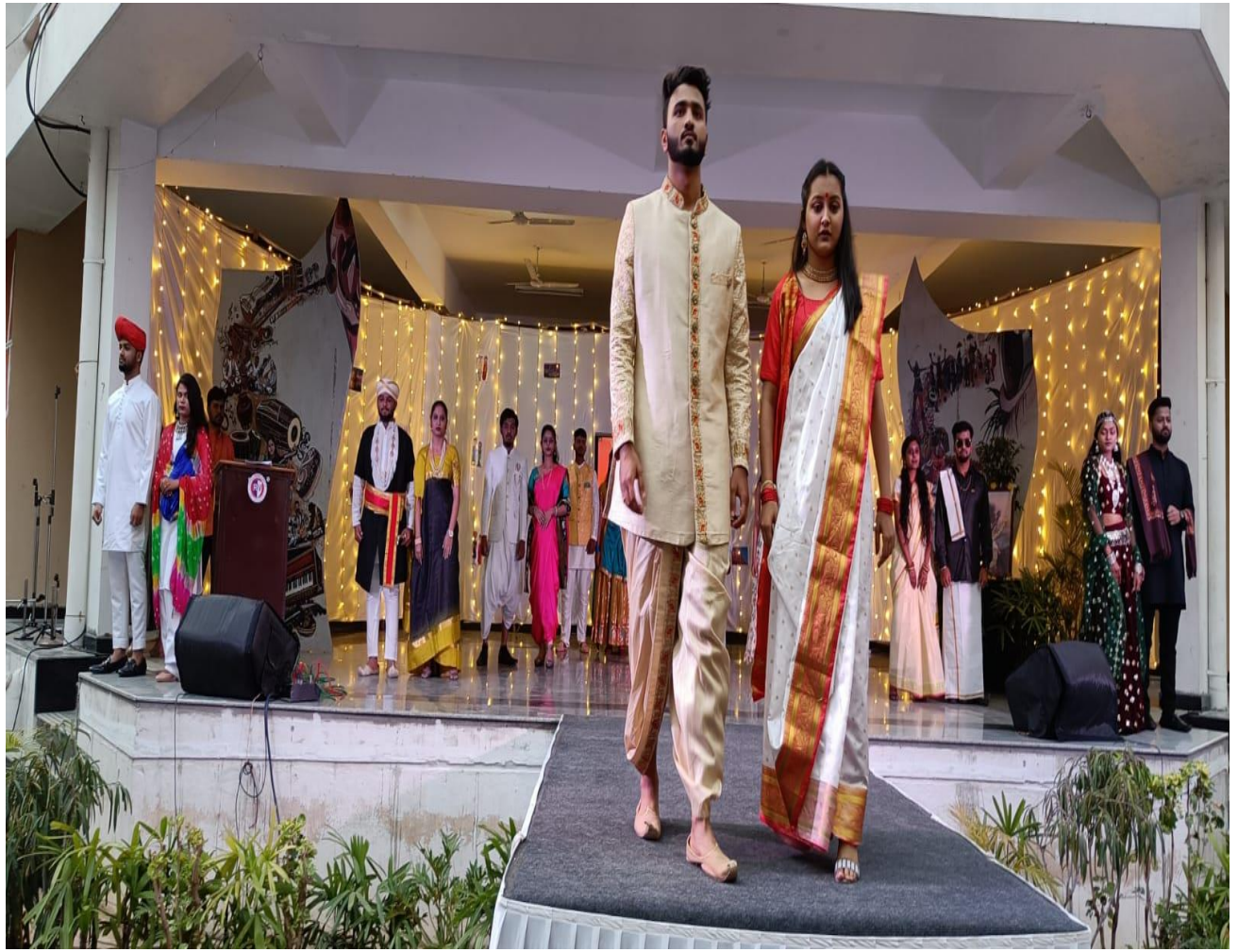
Students performing Ramp Walk during Matribhasha Diwas