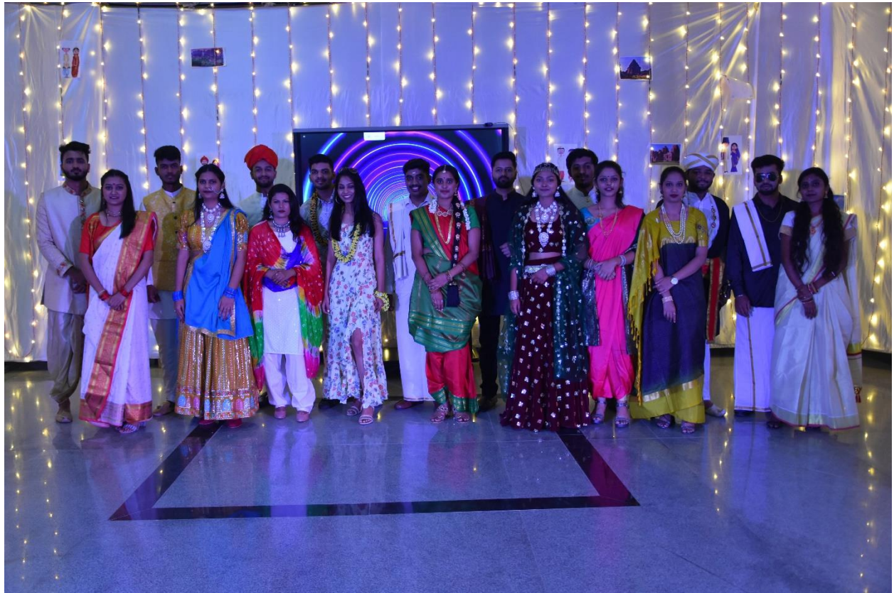
Group Photo of I Sem MBA Students with Traditional Attire