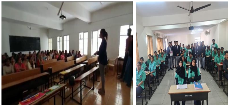
Campaign at College Campus

RVIM students of batch 2021-23 in their third semester conducted an awareness drive inform general public on the importance of their voting rights from the 6 th of February to 10 th February 2023. Awareness drive was conducted by organizing door to door campaign talking and informing public on the importance of voting and casting vote without fail, Street Play depicting the importance of casting ones vote was enacted by students in public places such as parks and play grounds near the college campus, Campaign at College Campus was used to build awareness on voting rights among the college students who are first time voters.