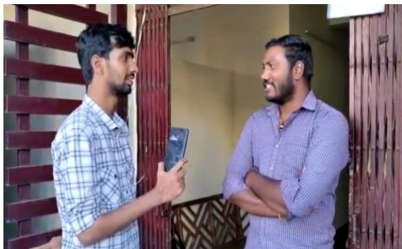
Door to Door Campaign