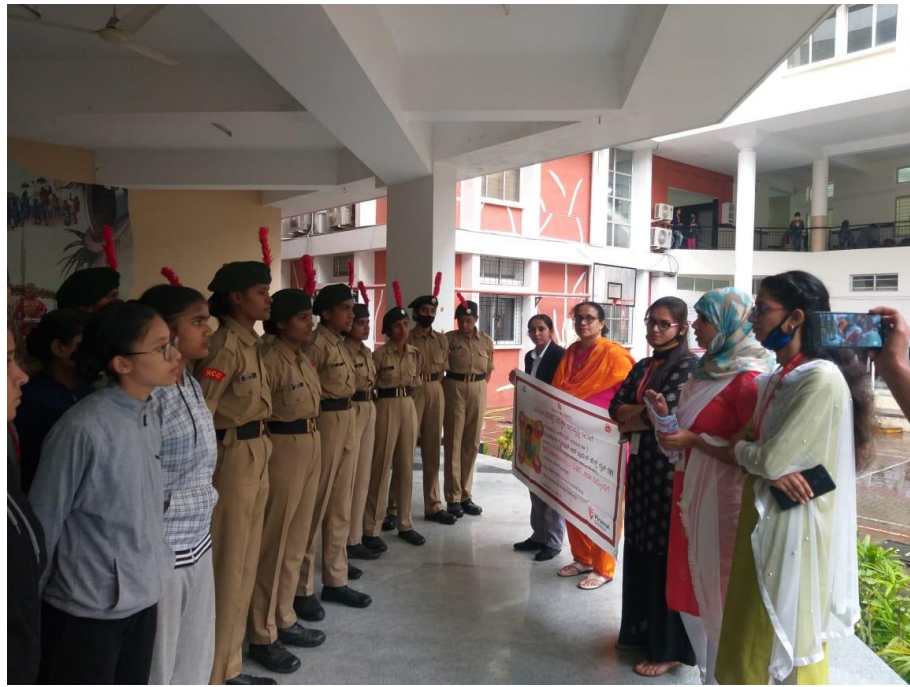
Addressing Girl Students Batch during NCC Rehearsal in SSMRV