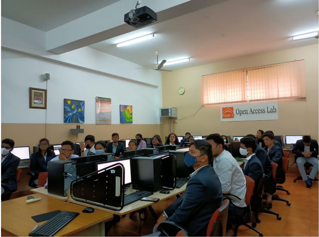
Students in Lab session