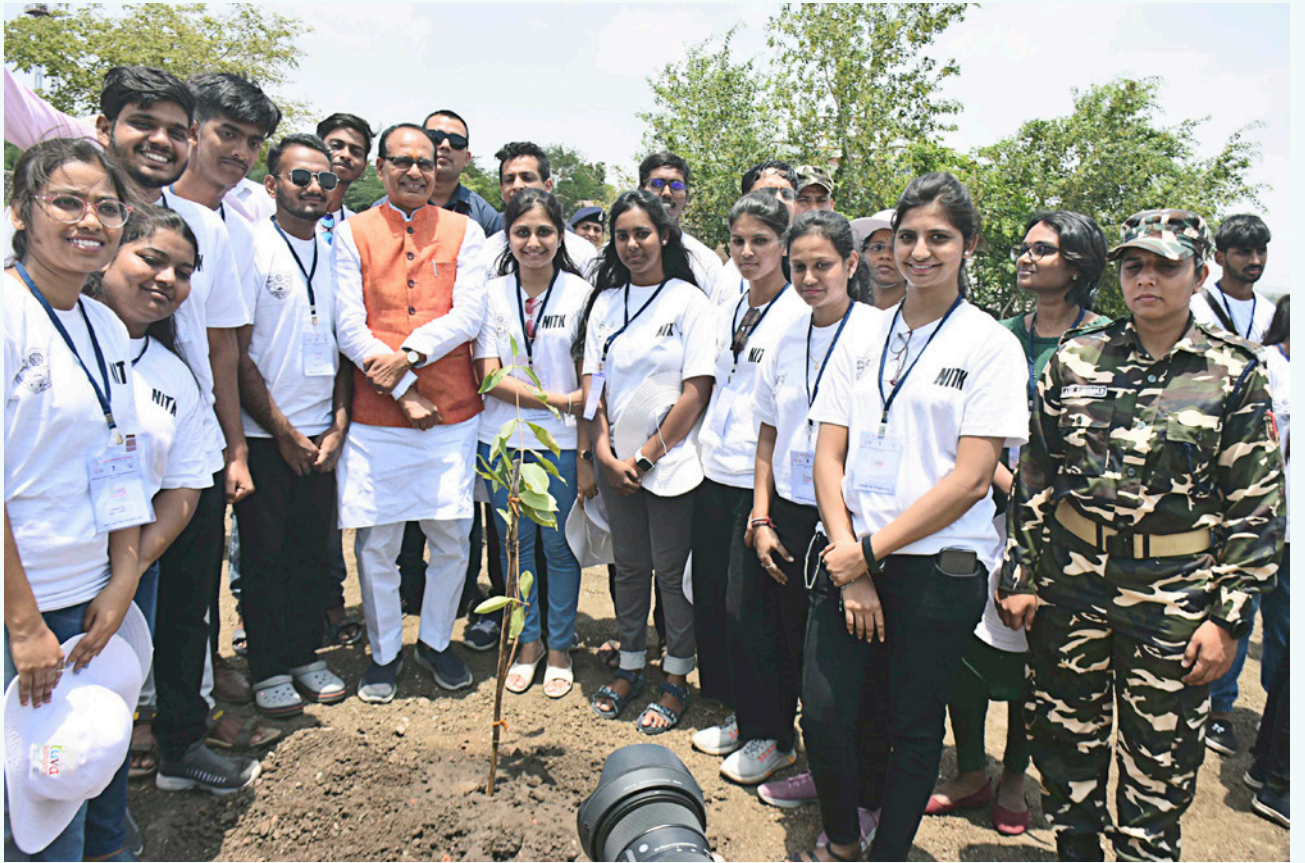
Visit to Tribal Museum by the Yuva Sangama team on the 14th of May'23.