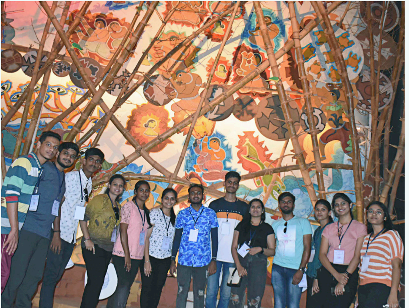
Yuva Sangam Team with Shri. Shri Shivraj Singh Chauhan Chief Minister of MP.