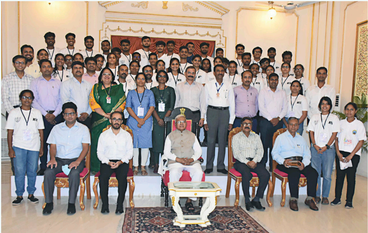
Yuva Sangam Team visit to governor house and meeting the governor of Bhopal on the 15th May'23.