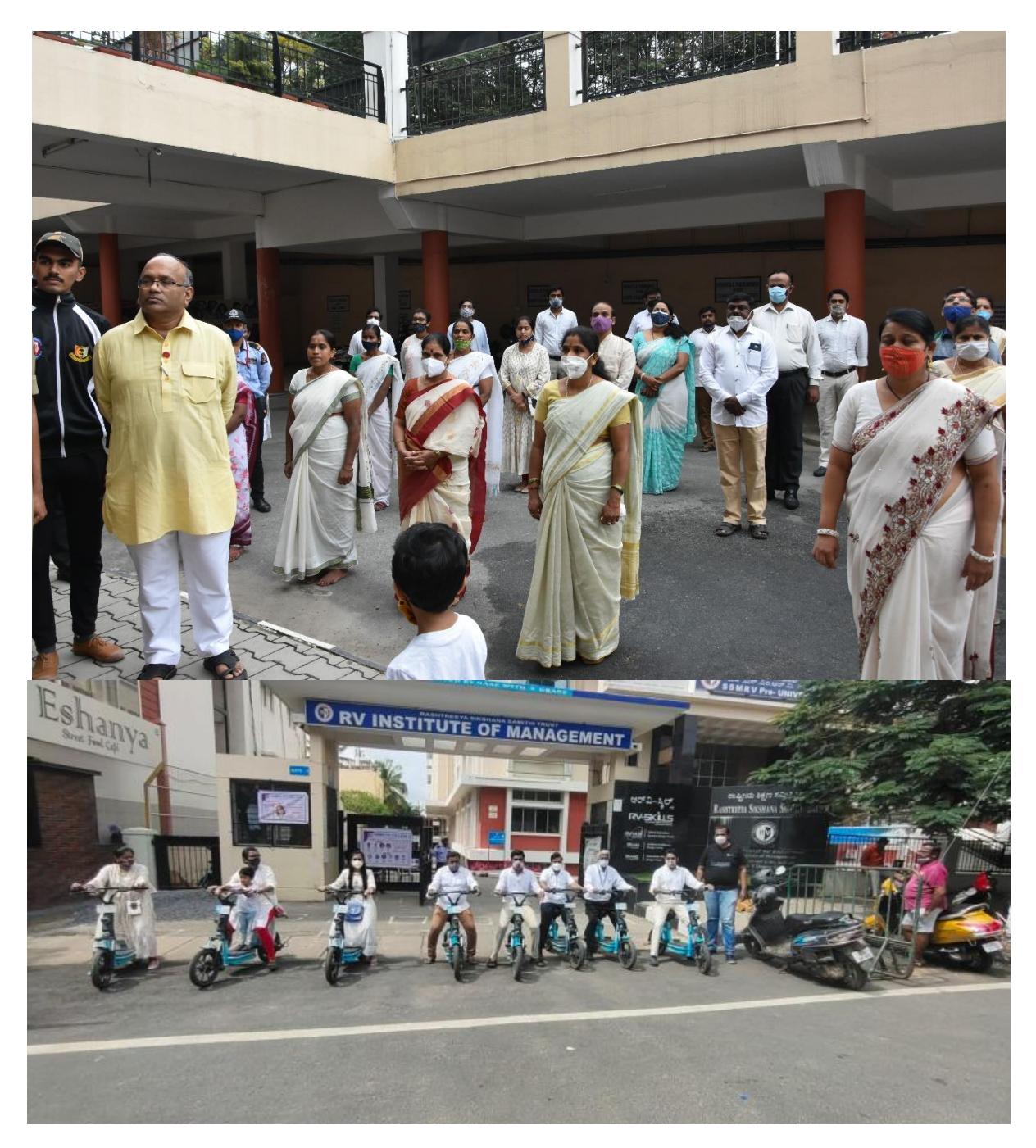
STAFF & STUDENTS PARTICIPATION