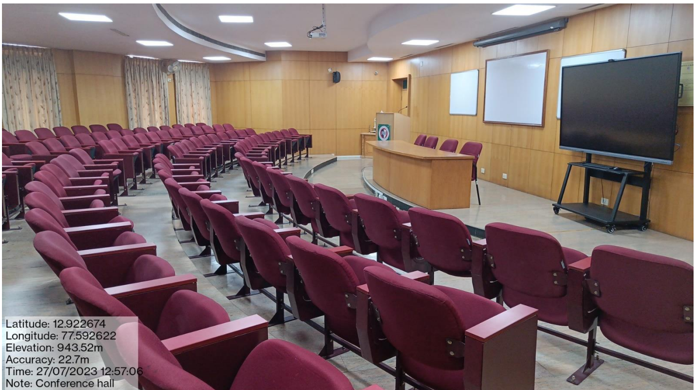
Latitude: 12.922674 Longitude: 77.592622 Elevation: 943.52m Accuracy: 22.7m Time: 27/07/2023 12:57:06 Note: Conference hall