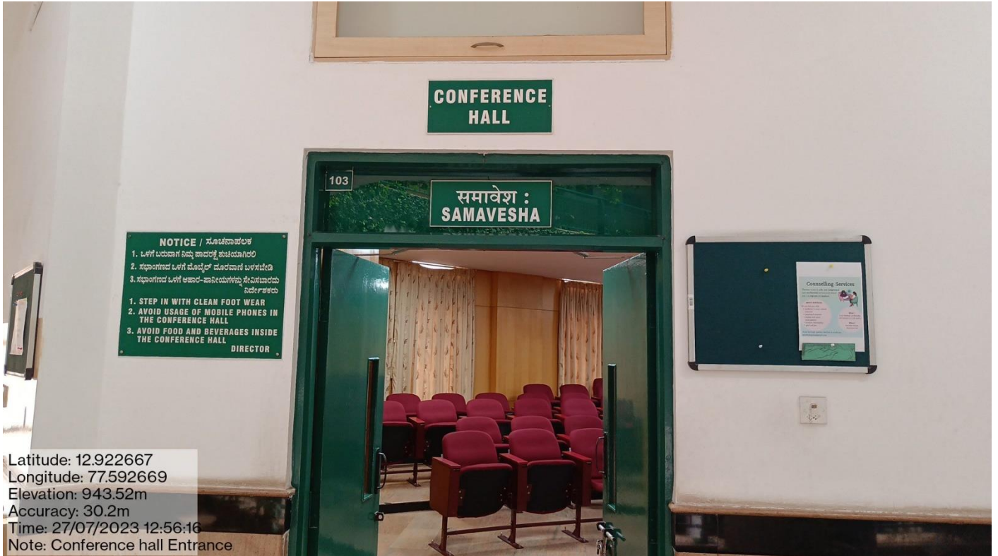
Latitude: 12.922667 Longitude: 77.592669 Elevation: 943.52m Accuracy: 30.2m Time: 27/07/2023 12:56:16 Note: Conference hall Entrance