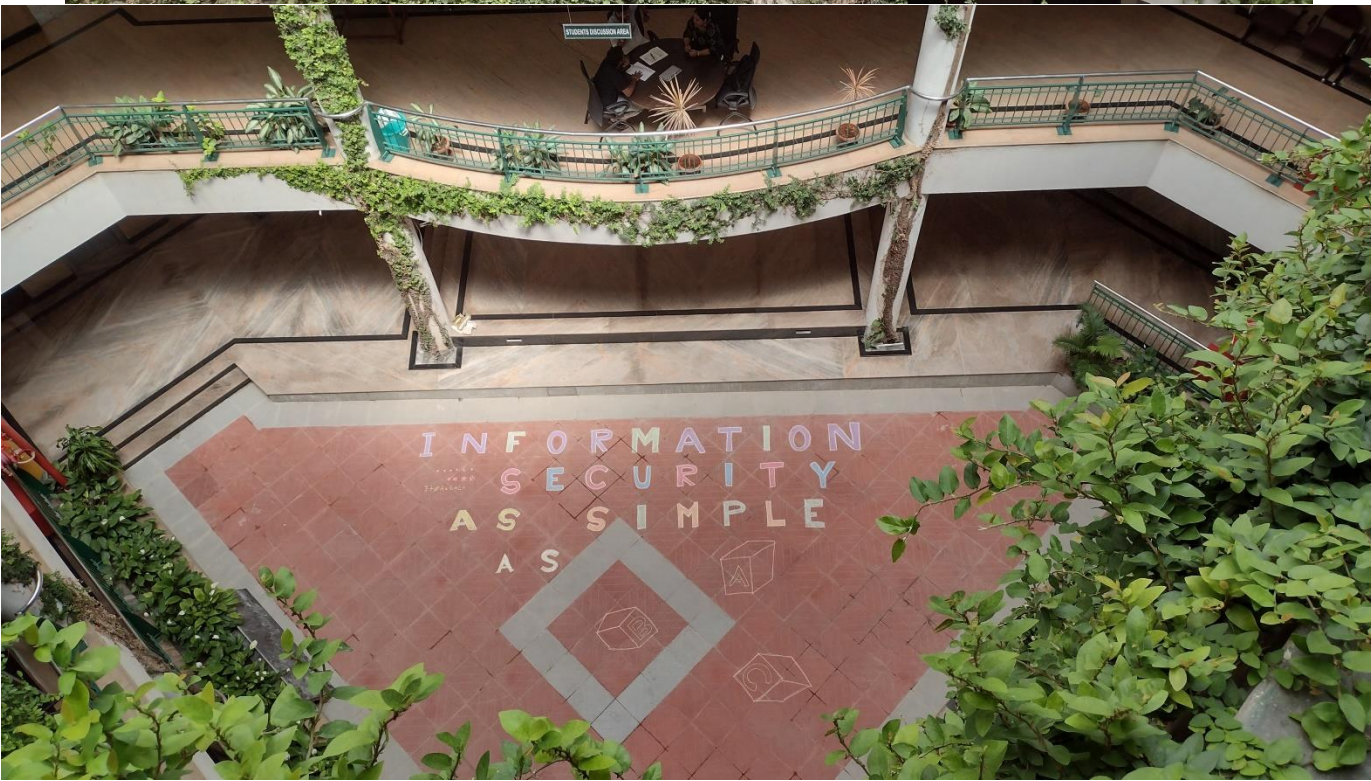
Floor Art on Information Security