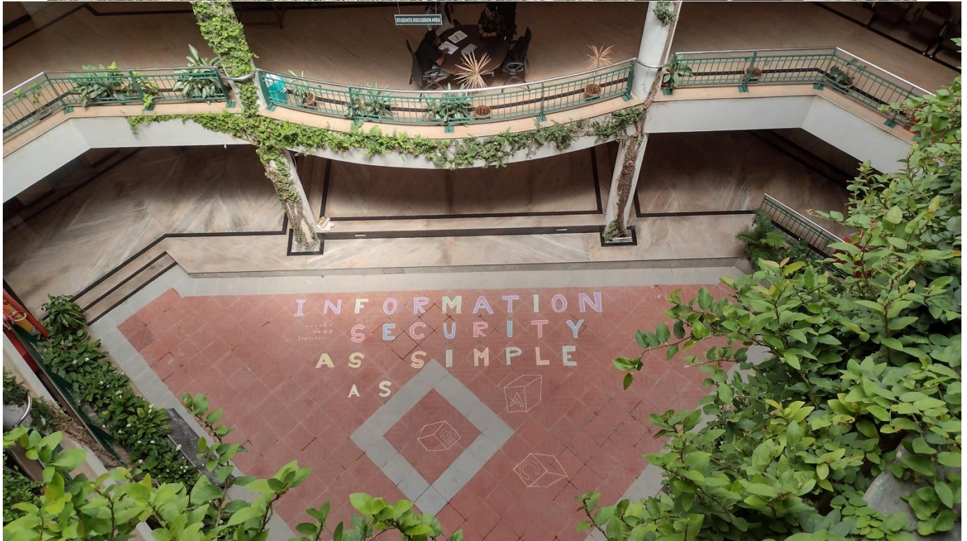
Floor Art on Information Security