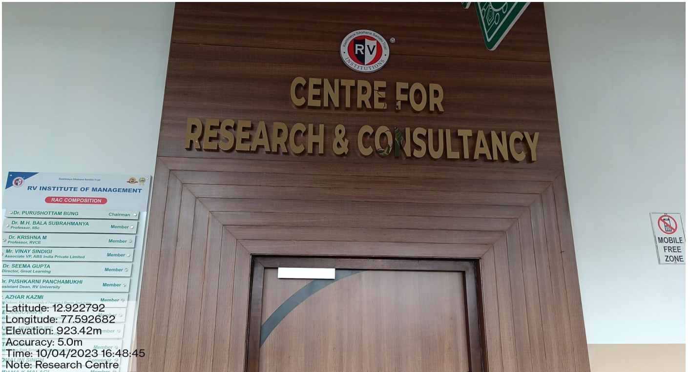
Centre for Research and Consultancy