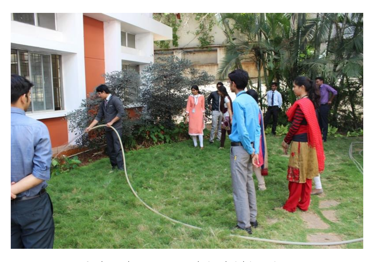
Student volunteers support during their leisure time