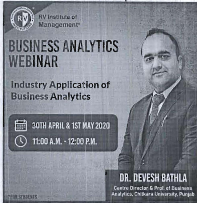
Digital Leaflet for the webinar