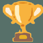
Table Tennis Women's