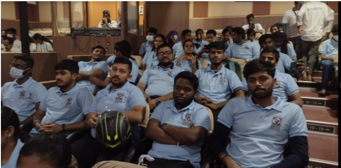
RVIM Student Volunteers

https://photos.app.goo.gl/e5ZqmbW91FA4u3Jj8