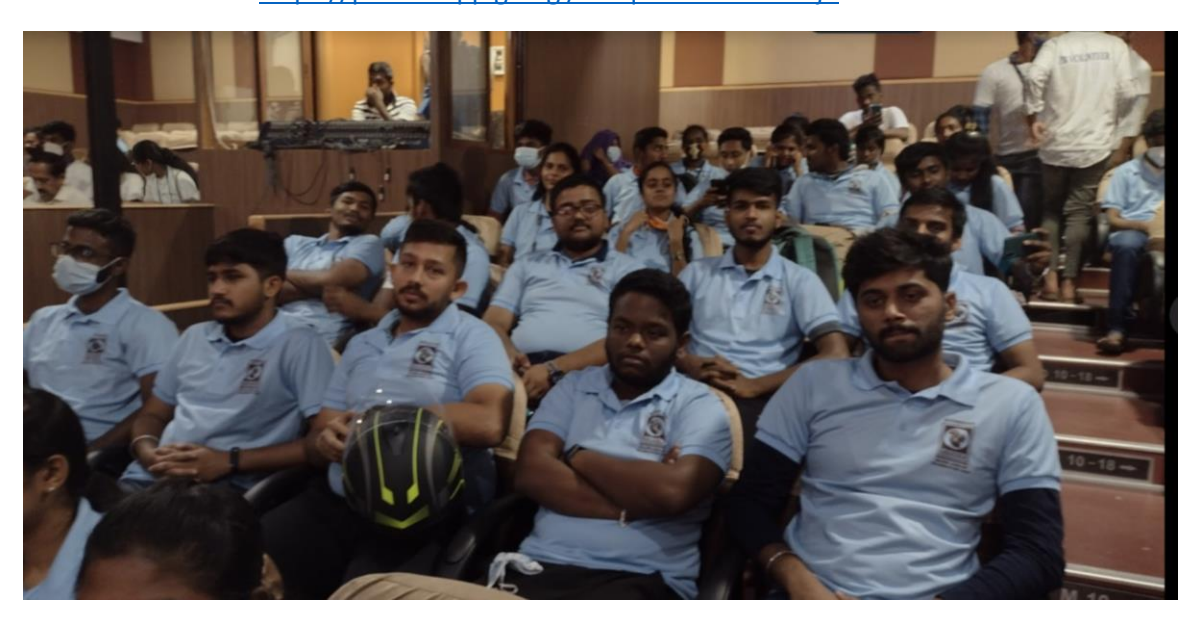
RVIM Student Volunteers