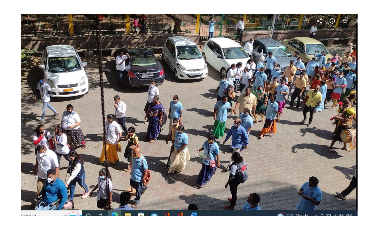
WATCH VIDEO <a href="https://photos.app.goo.gl/e5ZqmbW91FA4u3Jj8">https://photos.app.goo.gl/e5ZqmbW91FA4u3Jj8</a>