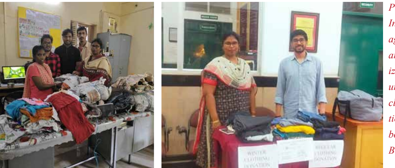
Pic Showing: RV Institute of Management Students and faculty organized a collection of unused articles and clothes for donation to NGO-Rainbow at Chamrajpet Bengaluru