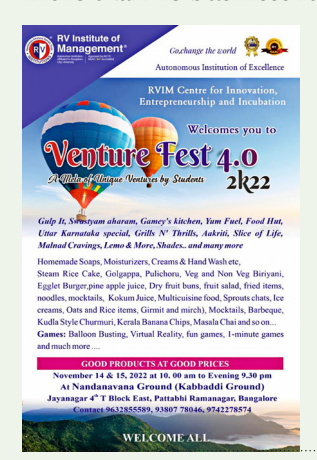
Venture fest event poster.

Venture Fest the flag-ship annual student organised event was held on 14<sup>th</sup> & 15<sup>th</sup> of Nov'22, students' venture stalls were open to the public for business for two complete days. Each stall exhibited students' business ideas which were proposed, planned and organised over three months before the finale. Two days of the fest is the final round of evaluation where the students put their ideas open for public sales. The Two day fest saw more than 18 business ideas enthusiastically cater to the public who visited.