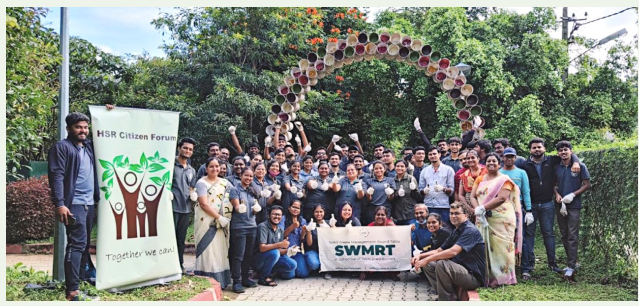
Visit to Swacchagraha Kalika Kendra, HSR Layout, Bengaluru

Centre for Social Responsibility organised a field visit of faculty and students to work on the Solid Waste Management process at the centre in HSR layout on 5<sup>th</sup> Nov., 22. Students were given hands-on practice on handling and managing solid waste from segregation of the waste to recycling process of biodegradable waste.