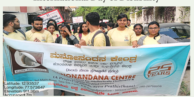
On 3<sup>rd</sup> Dec. 22 International Day for People with Disability was observed by organising a walkathon for the people with disability at Manonandana Centre Bengaluru which is an NGO school for the differently-abled.