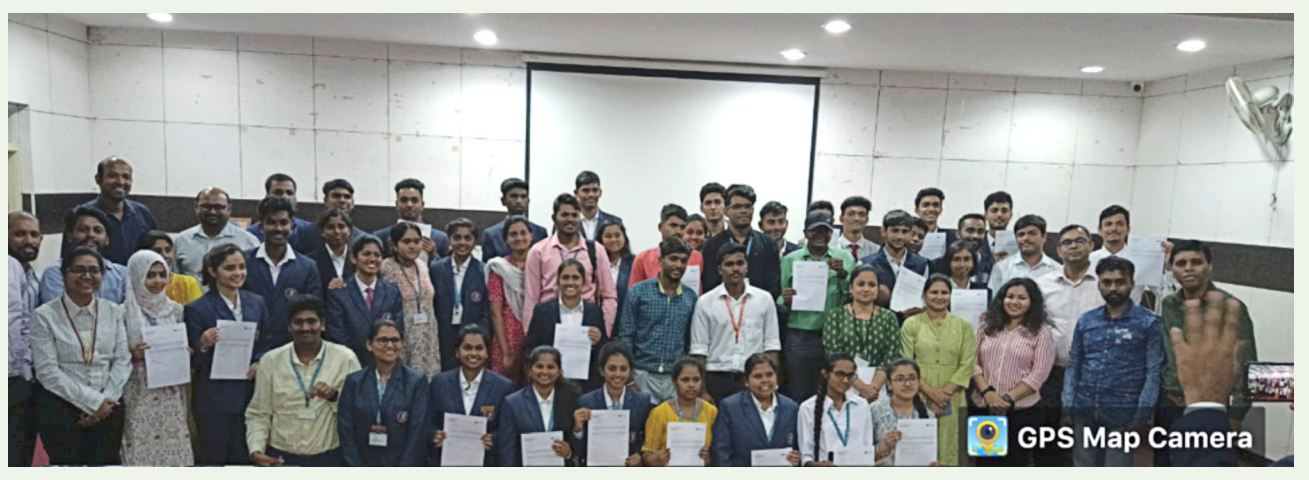
London Stock Exchange - Campus Drive the team with the selected students.