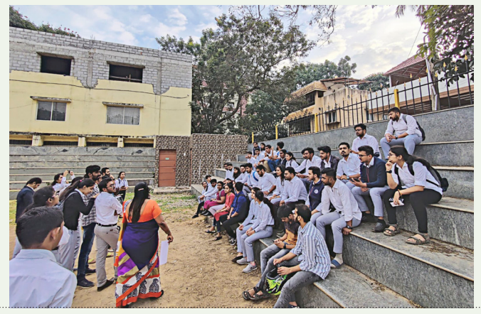
Auction session - students bid and get allotted stalls.