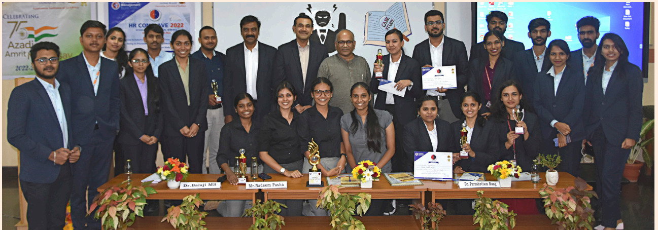
Winners at the HR Conclave