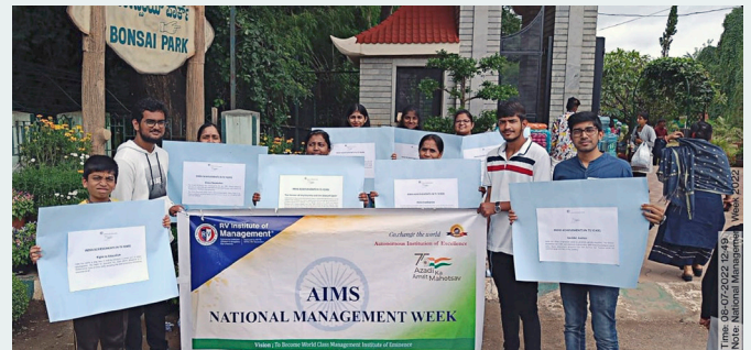
The students of second sem. batch 2021-23 interacting and informing on importance of 'azadi ka amruth mahaotsav' to the public at lalbagh.