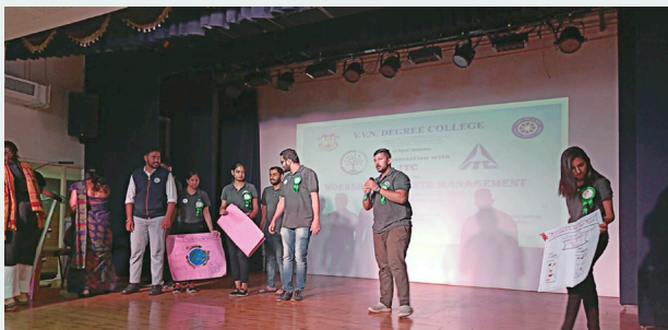
Students of 2nd Sem. of batch 2021-23 in the session at Vasavi Vidyanikethan College, Bengaluru

In collaborate with WOW ITC students of batch 2021-23 have initiated to make RVIM campus a green campus. In this regard three teams Green warriors of more than 70 students are working every day around the campus by spreading awareness on keeping the campus free of waste, correcting waste management habits and inculcating green practices, all these initiatives is aimed at creating a green campus.