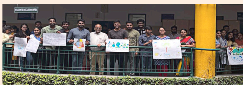
Students of batch 2020-22 participating in the poster making competition on the theme - Awareness of Sustainable Development Goals as part of National Management week 2022