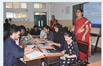
Photo gallery of the two day Student Development Program on Environment Society and Governance