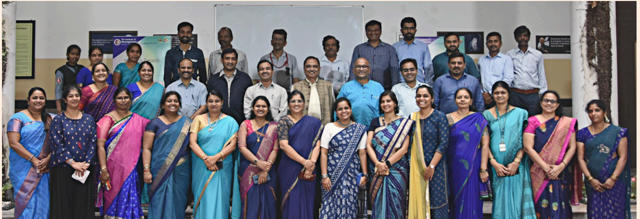
Faculty and Non-teaching staff of RVIM at the Strategic Retreat held on the 28th of September'22.

The strategic retreat 2022 was organised on September 28, 2022 to revisit our strategic plan and make necessary changes in the light of new developments of the institution. All the teaching and non-teaching staff participated in the retreat and discussed about future plans of RVIM.