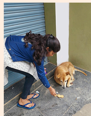
Students of second sem batch-2021-23 feeding and caring for stray dogs