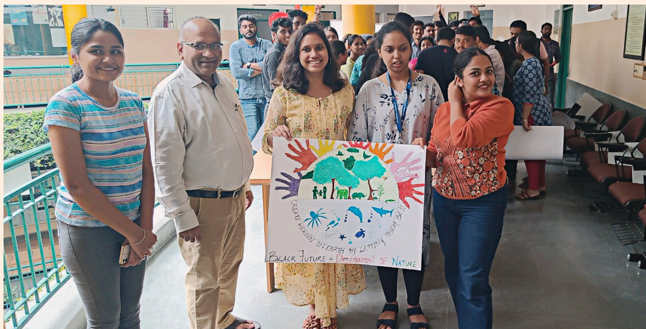
Students of batch 2020-22 participating in the poster making competition on the theme - Awareness of Sustainable Development Goals as part of National Management week 2022

Impact: Participants were able to understand and connect to the SDGs and visualize a sustainable future.