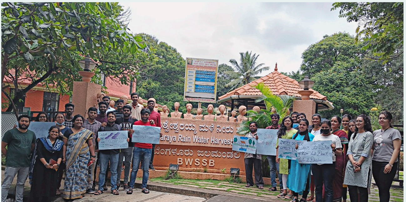
Students and faculty Visited Visvesvaraya Rainwater Harvesting Theme Park, Bengaluru on 2nd August'22