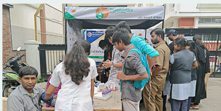
RV Institute of Management Students and Faculty organized a Free Medical Camp on 6th August'22 for benefit of general public

Free medical test camp was organized by RV Institute of Management Students and Faculty on the 6th of August'22 in association with Sun Diagnostics Bengaluru. The camp was open to public, more than a hundred general public, BBMP staff, street vendors took the benefit of the camp.