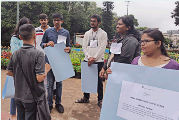
The students of second Sem. batch 2021-23 interacting and informing on importance of 'azadi ka amruth mahaotsav' to the public at lalbagh.

Impact: Acknowledging and celebrating the achievements made by our country and the importance of taking the Legacy forward.