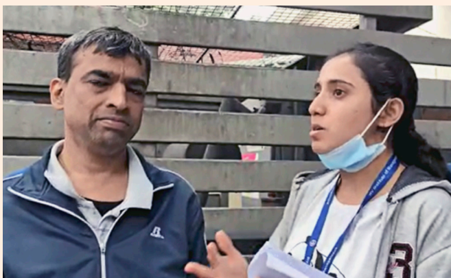
Sparsha A of batch 2020-22 getting responses of general public on their opinion on following COVID Guidelines

Impact: Spreading Awareness among Public on right usage of mask.