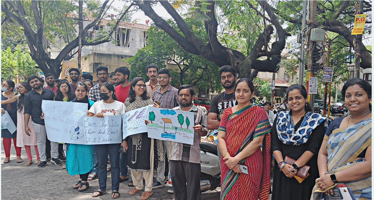
Students of batch 2020-22 and faculty participated in Public Awareness Walk organized on Rain Water Harvesting on 2nd of August'22

Impact: Students took the pledge to stop misuse of water resources and also conveyed the strong message to the general public regarding the importance of conserving rain water.