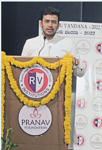
MP Bangalore South Sri Tejasvi Surya addressing the gathering