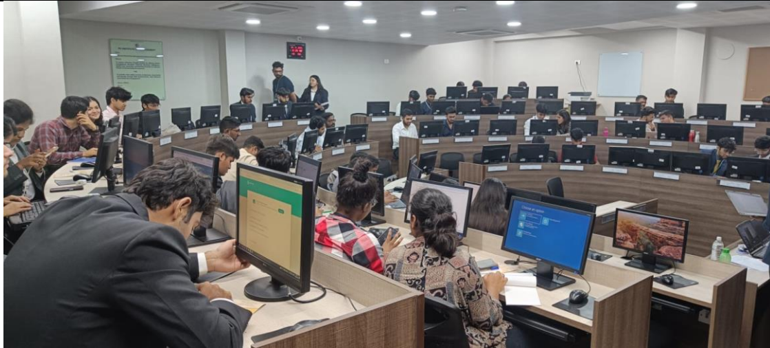
Students working on Assignment on IT Skills – Orientation Programme

contact.rvim@rvei.edu.in www.rvim.edu.in Tel: 080 42540300 080 26547048