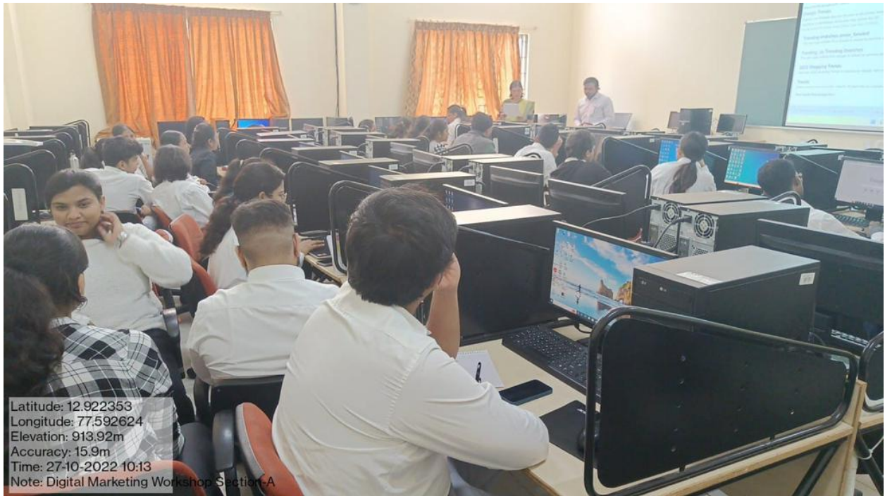
Mr. Kumar demonstrated Hands-On session on Website analytics using google analytics, Behavioural analysis and recent trends in AI and machine learning, Chatbots, Influencer marketing, Programmatic advertising, conversational marketing and online communities and co-creation.