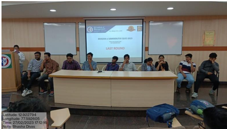
Photo of the Quiz Rounds