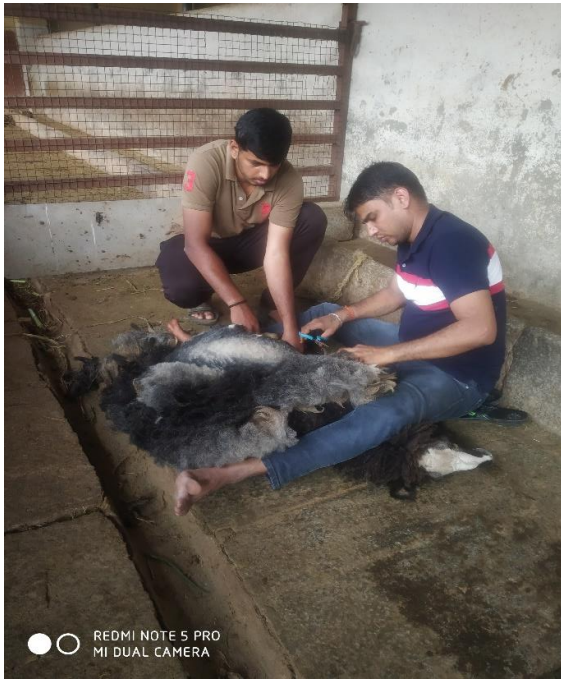
● ○ REDMI NOTE 5 PRO MI DUAL CAMERA