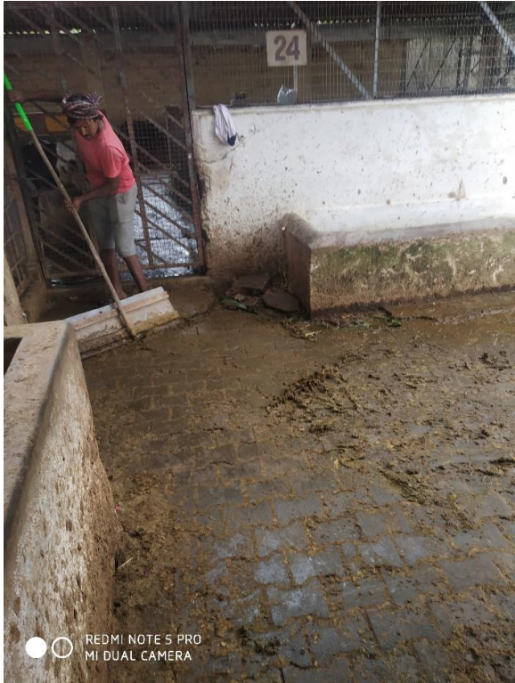
● ○ REDMI NOTE 5 PRO MI DUAL CAMERA