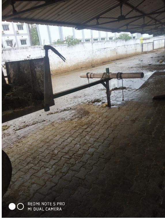
● ○ REDMI NOTE 5 PRO MI DUAL CAMERA