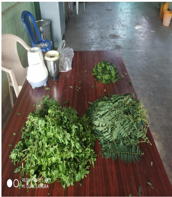
● ○ REDMI NOTE 5 PRO MI DUAL CAMERA